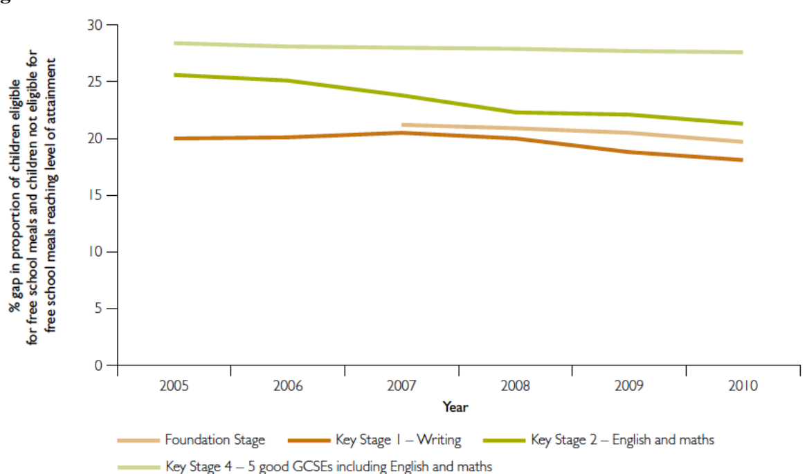
Figure 3: "Gaps in educational performance have narrowed only very slightly despite significant investment"

Source: HM Government (2010b, p.20) drawing on data from various official sources.