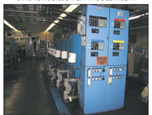
BEK FLEXO INK SYSTEM