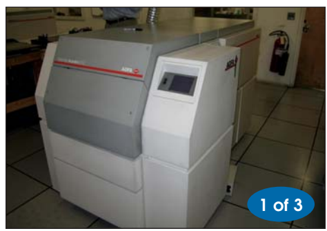
AGFA IMAGE SETTER MODEL SELECT SET AVANTRA 20/25 OLP