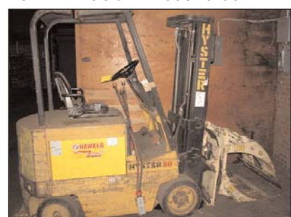
HYSTER 5000 LB FORKLIFT W/ROLL CLAMP