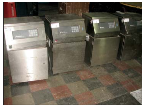
DOMINO SOLO INK JET PRINTERS