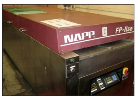
NAPP FLEXO PLATE PROCESSOR MODEL FP-IISE