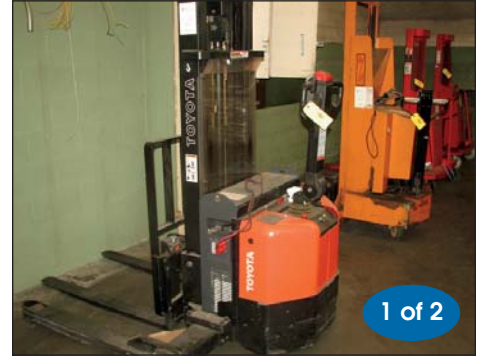
TOYOTA #6BWSL3 WALK BEHIND FORKLIFT