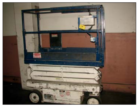
SKYJACK SCISSOR LIFT MODEL M3219