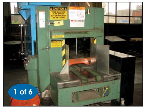
SIGNODE STRAPPER MODEL MLN2A