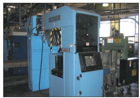
SHERIDAN STACKER MODEL OLYMPIA