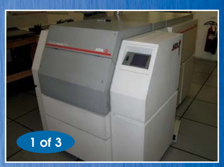
AGFA IMAGE SETTER MODEL SELECT SET AVANTRA 20/25 OLP