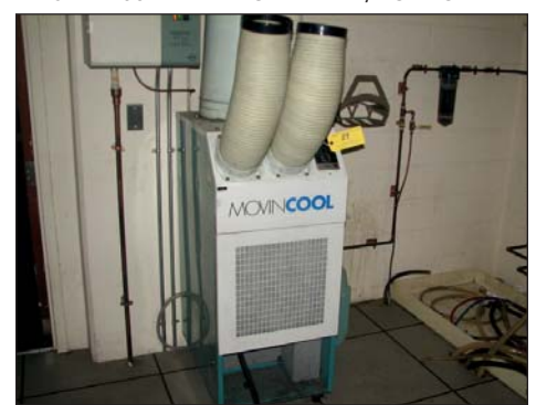
DENSO MOVIN COOL PORTABLE A/C UNIT