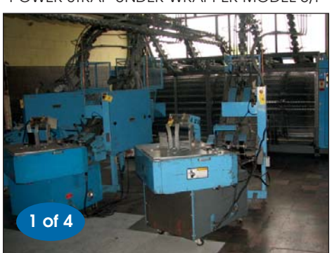
FERAG ROTARY INSERTERS