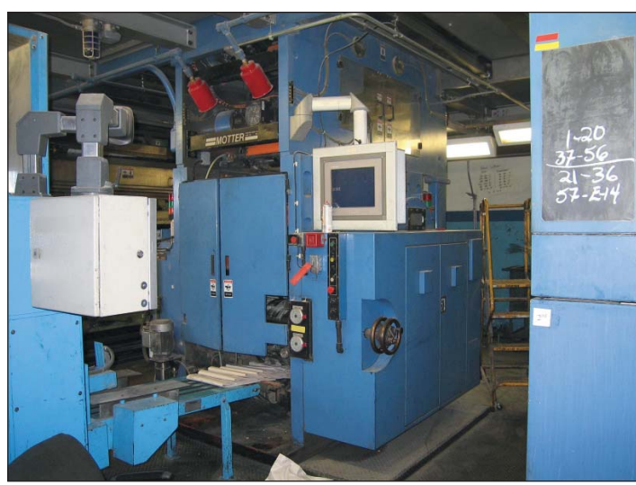
VIEW OF KBA COLORMAX NEWSPAPER PRINTING PRESS