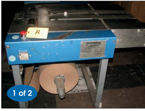
POWER STRAP UNDER WRAPPER MODEL 5/F