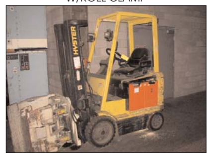
HYSTER 5000 LB FORKLIFT W/ROLL CLAMP