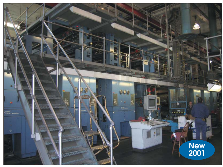
KBA COLORMAX FLEXO NEWSPAPER PRINTING PRESS