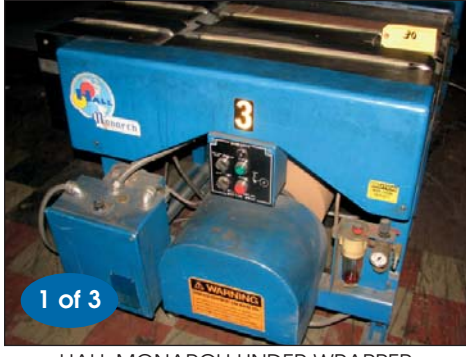
HALL MONARCH UNDER WRAPPER