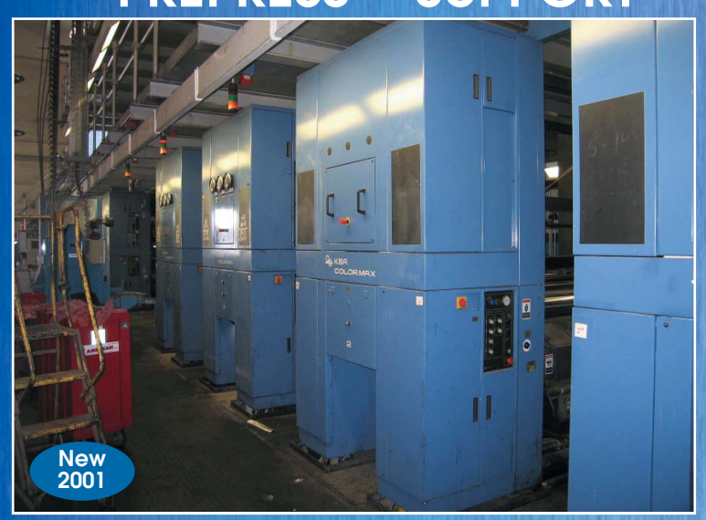
KBA COLORMAX FLEXO NEWSPAPER PRINTING PRESS

KBA FLEXO PRESS MAILROOM EQUIPMENT PREPRESS • SUPPORT