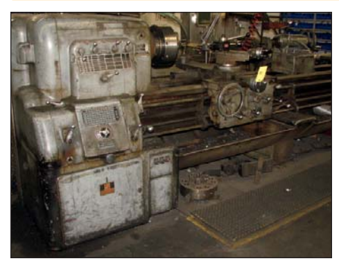
HERCULES LATHE, 24" X 60"