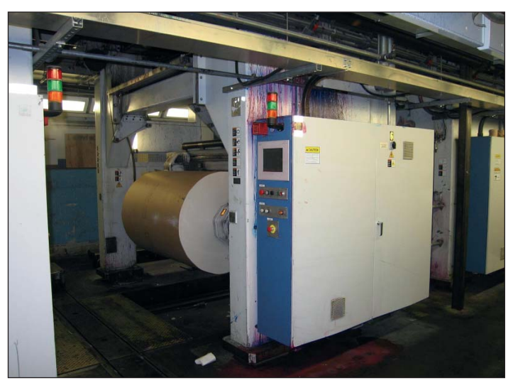
VIEW OF KBA COLORMAX NEWSPAPER PRINTING PRESS

(5) 1995 KBA Colormax CIC 4 Over 1 Flexo Print Unit S/N 95-1270A-01, 95-1270A-02, 95-1270A-03 & 95-1270A-04,