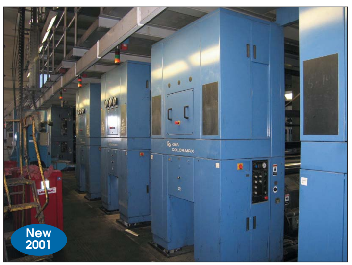
KBA COLORMAX FLEXO NEWSPAPER PRINTING PRESS