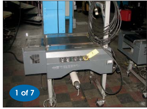
HEIDELBERG BOTTOM WRAPPER MODEL NP520