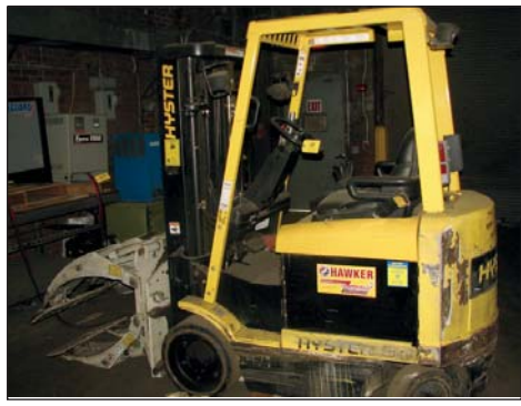
HYSTER E50XM2-27 FORKLIFT W/ROLL CLAMP