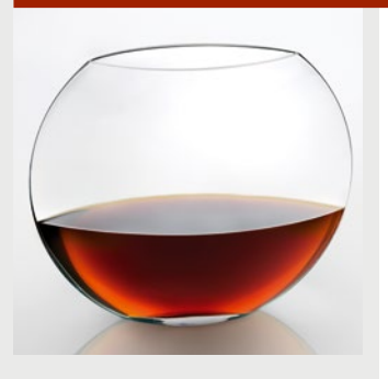
Application ■ skin lightening

Belides™ ORG is a natural skin-lightening agent, derived from organic daisy flowers ( Bellis perennis ). It is suitable for any skincare concept providing even and luminous complexion and radiant skin.