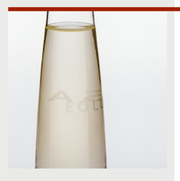
Application ■ anti-hair loss

Follicusan™ DP stimulates the functionality of the dermal papilla cells at the base of the hair follicles, thus counteracting premature hair loss. It increases the number of anagen hair follicles (growth stage) and decreases that of telogen hair follicles (resting stage). Hair density as well as cumulative hair thickness is increased.