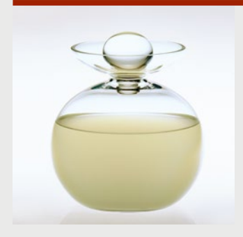
Application skin protection

is preserved with phenoxyethanol and sodium benzoate.