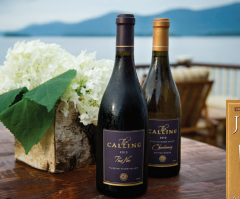
The Calling includes Chardonnay and Pinot Noir cultivated in the Russian River Valley and Cabernet Sauvignon (not pictured) grown in Alexander Valley, all of which have been awarded multiple scores of 90 and above.