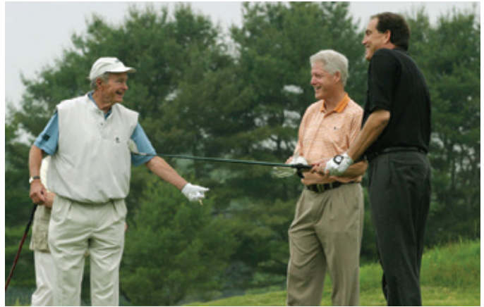
Nantz enjoying a round of golf and camaraderie with President George H.W. Bush and President Bill Clinton in Kennebunkport, Maine.