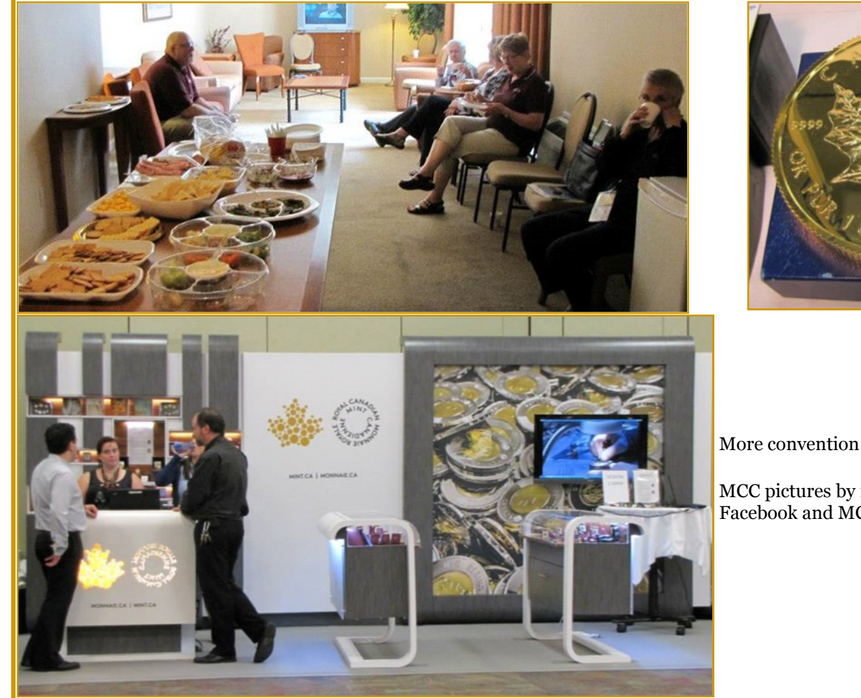
More convention pictures:

In 2014, MCC celebrates 60 years of numismatics education and fellowship! Your Editor is looking for early 1950s-1970s pictures to feature each month of 2014, in the MCC newsletter; and well as interesting historic stories about the club.