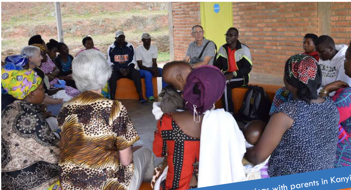
A productive meetings with parents in Kanyinya