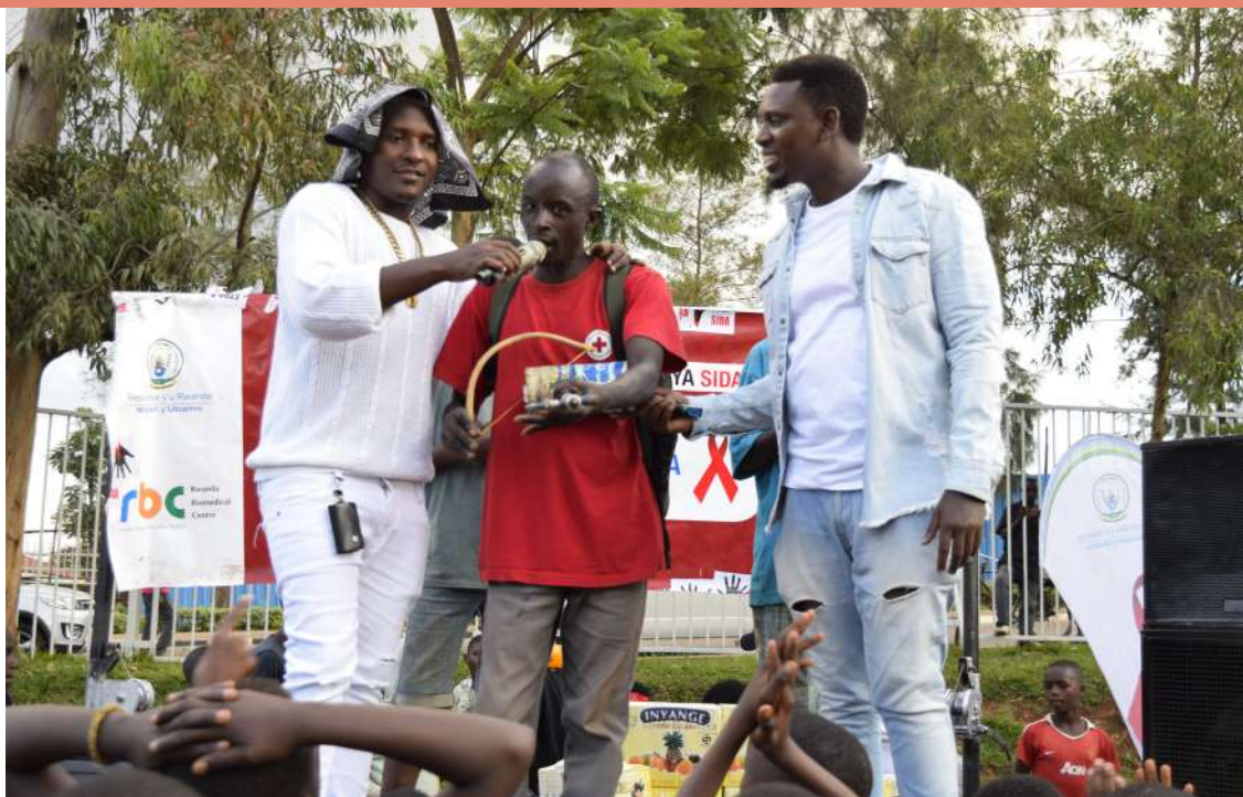
In collaboration with Rwanda Biomedical Center with other health partners on 27 th December at the Club Rafiki we organised a big campaign for educating youth on HIV prevention, during this event Dream boys was there to entertain their peers and promoting their talents.

We declare our resolve to use the spirit of sport: friendship, solidarity, empathy for others, cooperation, and the mutual respect to overcome this challenges together.