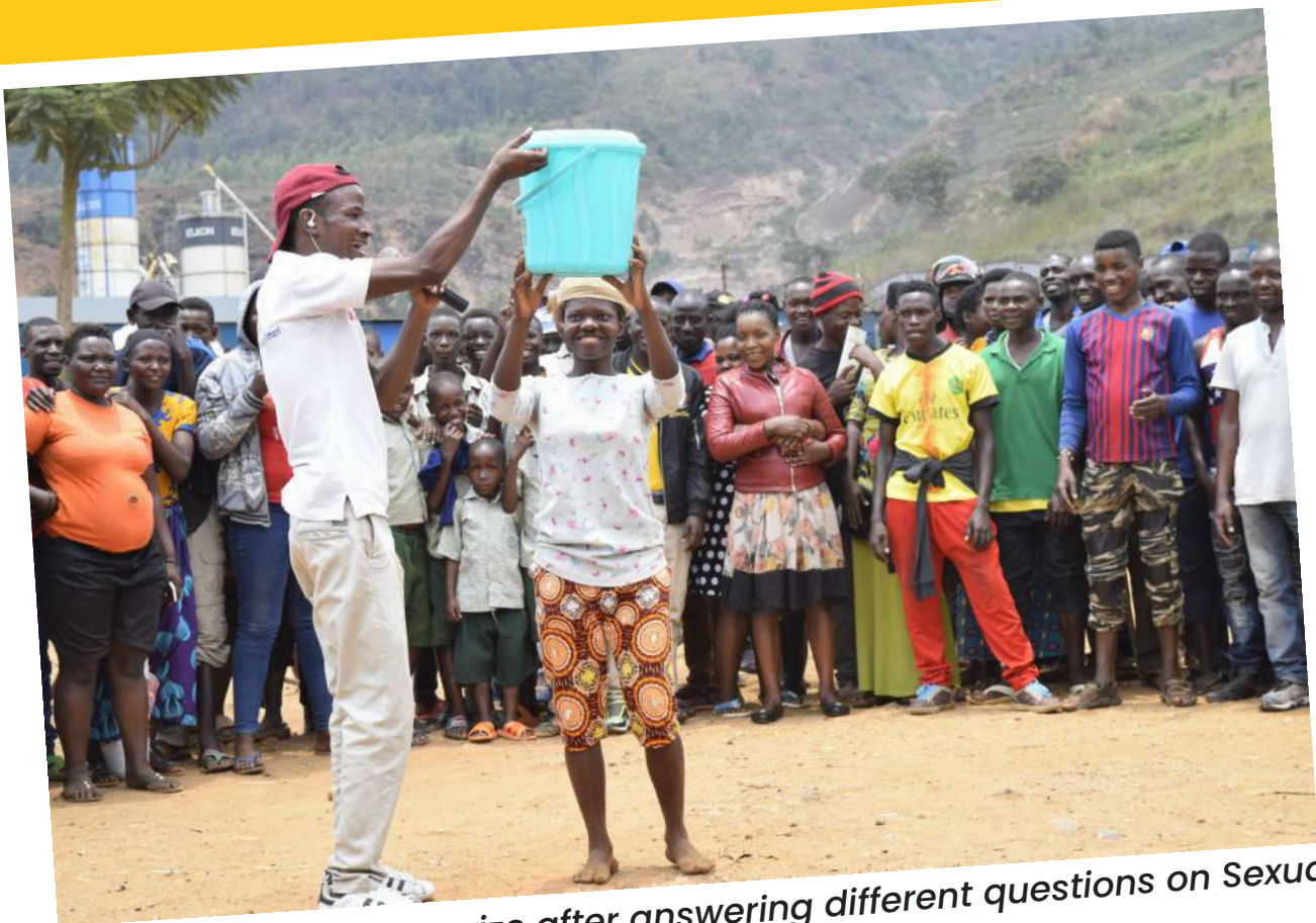
...Young girl receiving a prize after answering different questions on Sexual and Reproductive Health...

From certain period of time we realized that young girls early pregnancy has become a problem that needed to be addressed at national level, early pregnancy among teenagers has become a cause root of poverty to them thus their dreams are crushed because of pregnancy, Therefore Club Rafiki as a youth center recognized the need of educating these young girls and women on issues of sexuality so that they may become aware of it danger and the consequence surrounding others STD as well, so that they may be able to make knowledgeable decision regarding their sexuality.