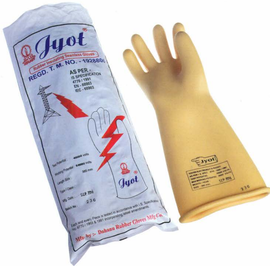
TABLE OF UNIVERSALLY ACCEPTED “JYOT BRAND” ELECTRICAL RUBBER HAND GLOVE IS GIVEN BELOW:-

JYOT gloves are produced from specially compounded Latex that offers excellent dielectric properties combined with great flexibility, strength and durability.