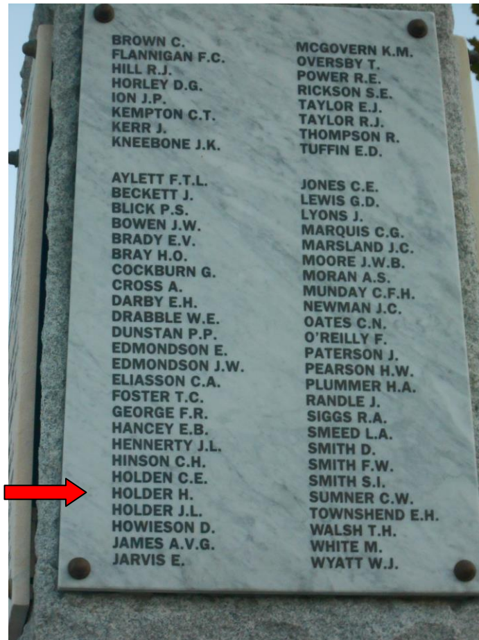
West Leederville War Memorial with new back panel