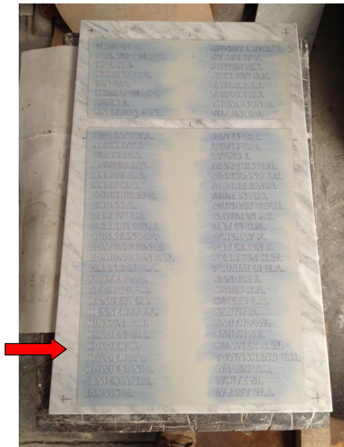
The work in progress by Perth Monumental Works – a mock up of how the names would fit on the back panel