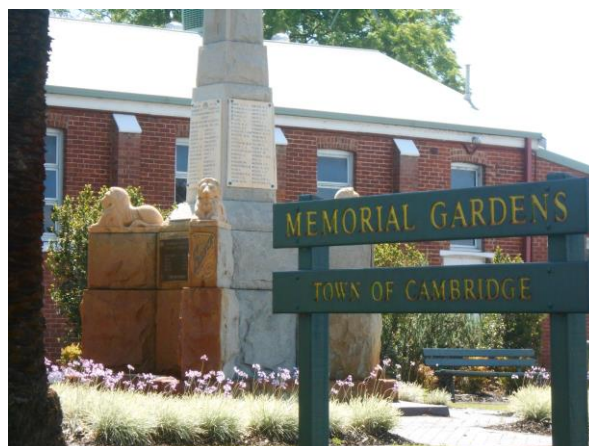
West Leederville War Memorial