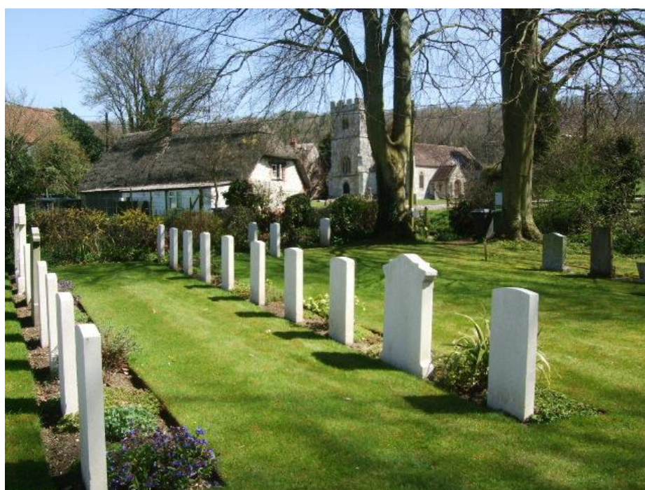
© Cathy Sedgwick/2013 (updated May 2015)