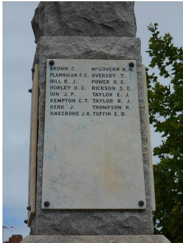
West Leederville War Memorial & the existing back panel where the additional 50 names were added.