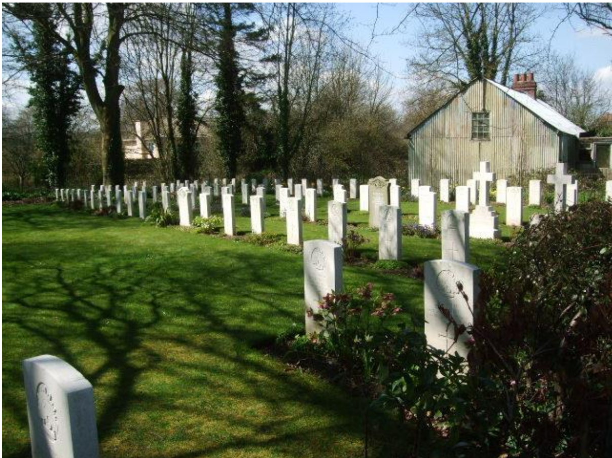
Anzac Cemetery, Codford

Outcome – Pte Holder has the Christian Cross on his CWGC Headstone.