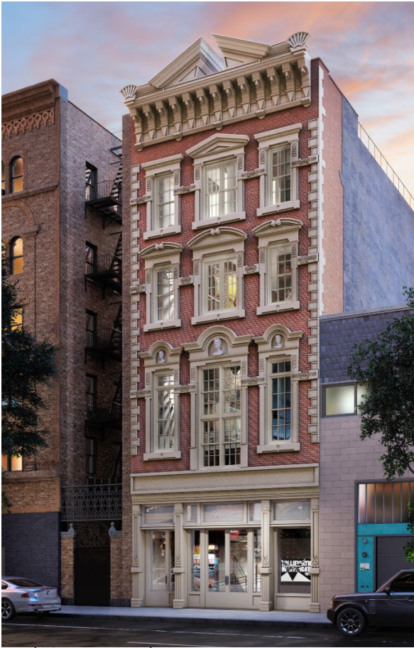
Rendering: 74 East 4th St.

La MaMa's historic, landmark building at 74 East 4th Street is undergoing an urgently needed complete renovation and restoration to preserve the historic façade, create building-wide ADA accessibility, and provide much needed performance, exhibition and community space for decades to come.