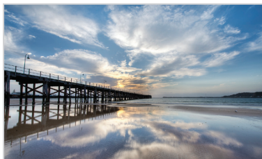
Picturesque views everywhere.