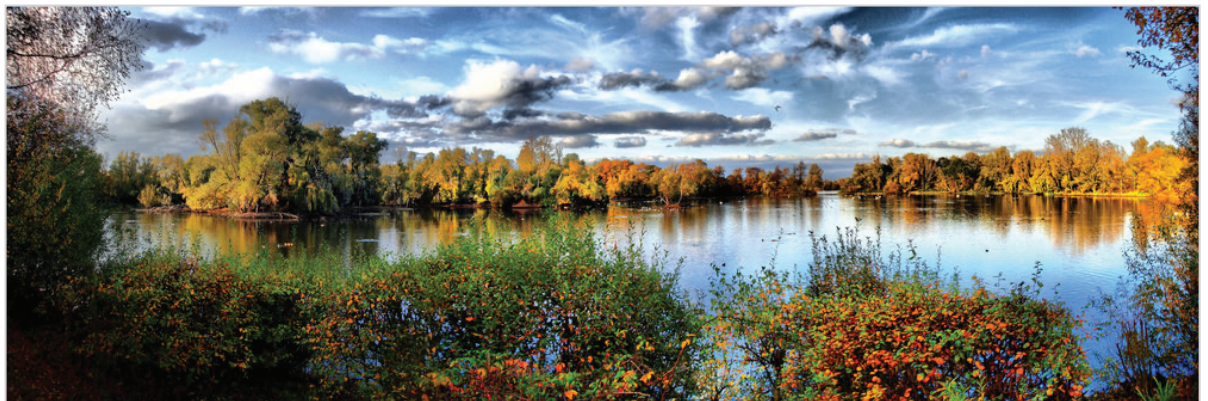
Coffs Harbour has a lot of attractions.

Once again a very pleasant weekend with extremely good cakes and slices from the local members - thank you!