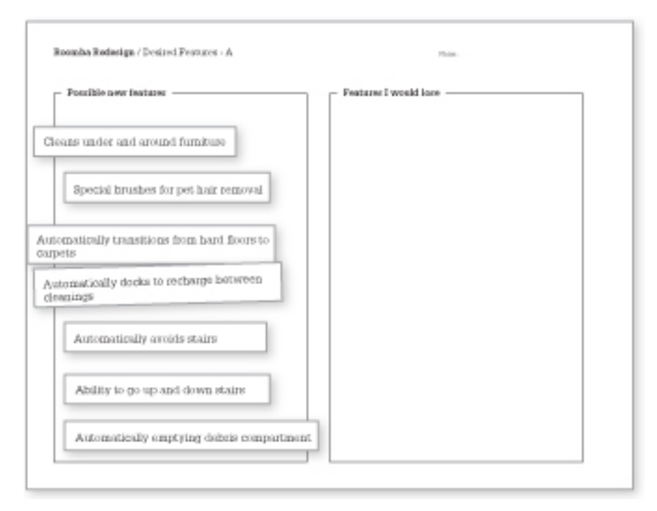
Figure 3 Feature selection worksheet for Group A (loss frame), showing a subset of features

Participants in Group A will be presented with a set of 18 possible features for a robotic vacuum cleaner and asked to remove the features they would not include in the final design (the loss frame). Participants in Group B will be presented with the same 18 possible features and asked to select the features they would include in the final design (the gain frame). Each participant will receive 18 strips of paper naming the features along with a worksheet upon which to arrange them (see Figures 3, 4).