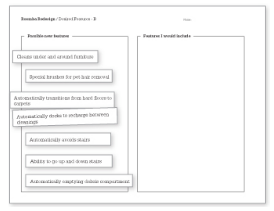
Figure 4 Feature selection worksheet for Group B (gain frame), showing a subset of features