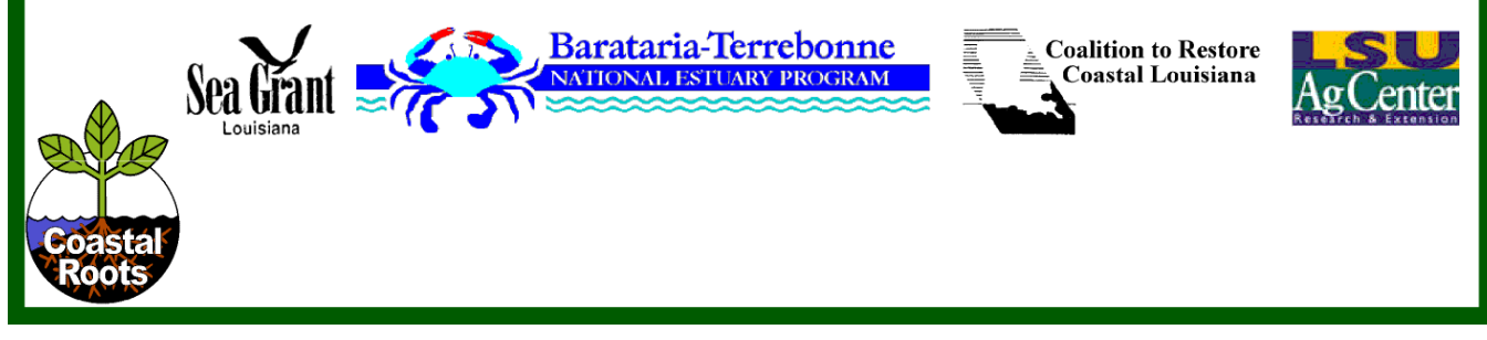
Coastal Roots: Collecting and Organizing Data