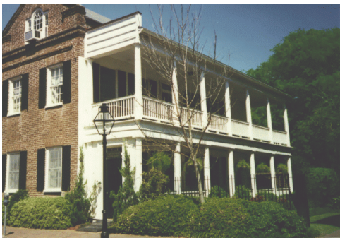
14 Glebe Street

The Philosophy Department is relatively small and informal. You will find the professors accessible and helpful. Our facilities are intended to serve as an academic “home” for our students, and we hope that you make good use of them.