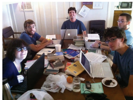
Students studying in the lounge