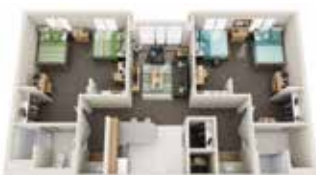
Martin Hall - Justice & Safety LLC Floorplan 1