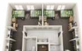
Martin Hall - Justice & Safety LLC Floorplan 2