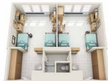
Telford Hall - Colonel Barracks Floor Plan