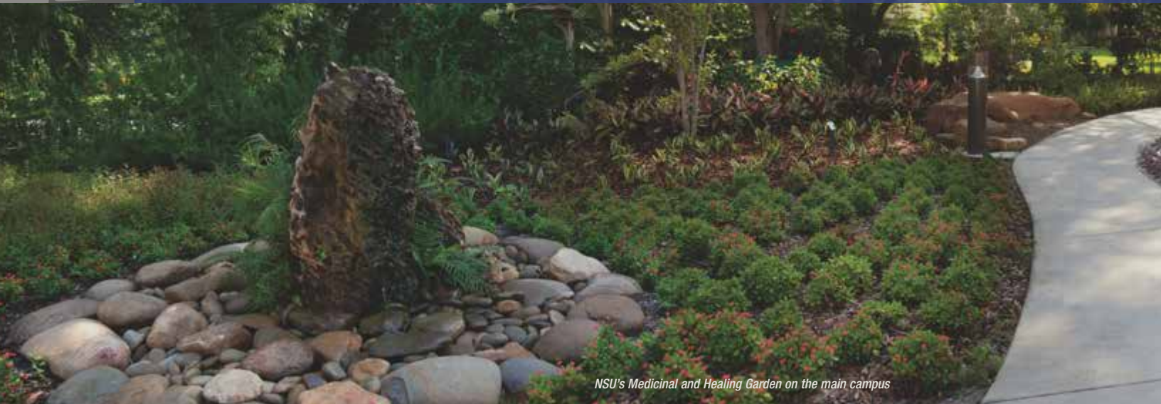
NSU's Medicinal and Healing Garden on the main campus