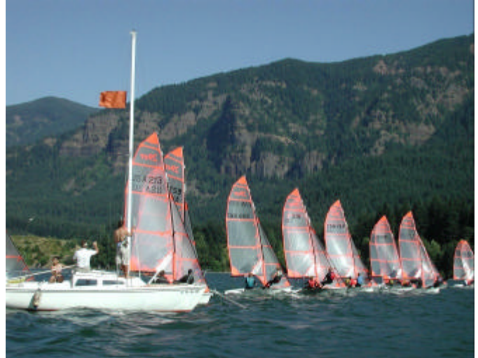
The Race Committee starts the 29ers at the 2003 29er North Americans at Cascade Locks

A harbor and moorage office would be necessary to manage moorage facilities directly associated with the sailing center, including collection of moorage fees. This office would also oversee the maintenance of docks, launch ramps, hoists and grounds around the sailing center.