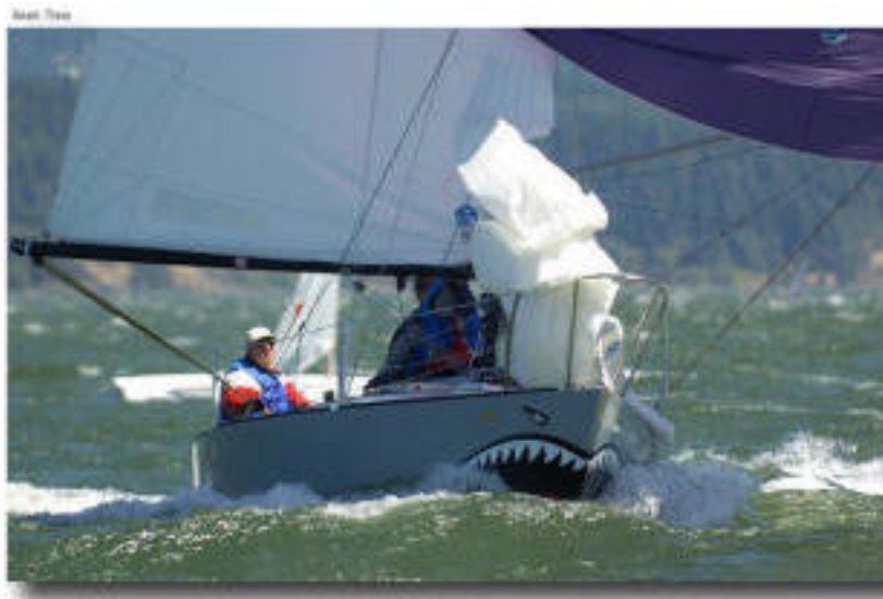
"Shark Attack" The J24 Bite Me, shows beautiful downwind form sailing in the gorge.

The Sailing Center would also be available for community activities such as meetings, work groups and other community functions. Private functions and family gatherings would also be allowed on an availability basis.