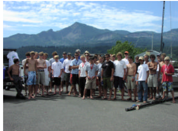
Current awards ceremony facilities consist of the beach parking lot. Gorge Games 2004.

Because sailing is such an intense sport, and so much time is spent on the water in the sun, it is imperative that sailors have nearby access to quality food and beverages. A brunch/snack bar would sell high-energy food and drinks, and provide sailors and spectators with that most critical meal of the day - breakfast.