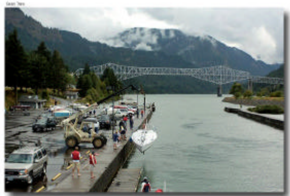
Temporary hoist brought in for CGOD 2004.

In addition to the ramp, a hoist would be necessary for the launching of larger keelboats. Again, the hoist should be located and access should be designed for appropriate flow pattern and dock space for 10 or more keelboats. The hoist should be able to launch boats and retrieve boats in 15 minutes or less. Boat classes launching with a hoist include J24, Santa Cruz 27, Moore 24, Santana 20, Etchells and Olson 30. Other larger keelboat classes could be included depending on the hoist weight limits.