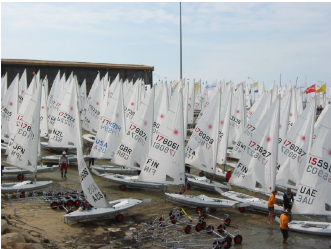
2003 Laser Masters World Championship; Cadiz, Spain

Successfully hosting major regattas is the best and most cost-effective way of spreading the word about Cascade Locks, maintaining a good reputation within the sailing community, and attracting even more attention. Demand will continue for national, international and even world-class One-Design regattas at Cascade Locks as long as high quality race organization and management is in place to provide excellent racing and regatta facilities. A world-class sailor will only want to spend time and money to bring a boat from a long distance to a regatta site that has a reputation of great racing. A sailing center facility would not only provide the expected quality regatta to world-class sailors, but also to the beginner and aspiring competitive sailor. A full service facility would provide a better base of operation to accommodate regattas for many different kinds of boats that require different launching options. Under the direction of a full-time staff, a full service sailing center would be able to market and attract bigger sailing events and promote participation.