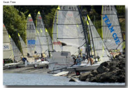
Competitors on the beach, preparing their boats for racing.

With any regatta or sailing activity there is a considerable amount of time spent by competitors in a staging area preparing their boats for sailing. The staging area could be the moorage area, the beach launching area or possibly a large grassy area near the launch site or near the parking area.