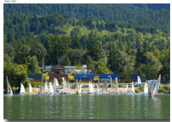
Current Beach facility at Marine Park.

For the small boat events that Cascade Locks is famous for, the ability to launch many boats simultaneously and be able to accommodate many boats coming back from the racecourse at the same time is key. A beach provides this function very nicely for smaller centerboard boats. The beach should be in a bayside location composed of boat-friendly sand and gravel with an appropriate angle of entry into