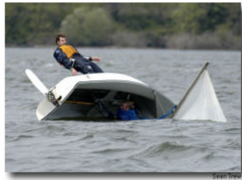
College students practice capsizing recovery in the Gorge at Cascade Locks

One of the higher-level functions of a sailing facility is to provide a training ground for honing skills and preparing for major events. To provide a good training environment, the most critical components are a safe sailing environment and plenty of consistent wind. Locations blessed with these natural factors can find that they are overwhelmed with sailors looking to stay for a certain amount of time and train with coaches and training partners, or as part of a clinic. Whether sailors are top Olympic aspirants, or just local club racers hoping to improve their game, they will be enticed by the top instructors and great sailing conditions to come and hone their skills.