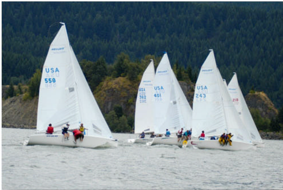
Melges 24s race upwind at the 2003 Columbia Gorge One Design Regatta

Sailboat racing involves more than just hopping in a boat and going as fast as you can. In all but the one-man dinghies, racing requires not only good boat handling and tactical skills, but also the ability to work with the rest of the crew as a team. Sailors of all skill levels can learn to race, and in so doing improve their sailing, analytical and organizational skills. Racing teaches us to set goals, establish priorities, work closely with our teammates, focus and concentrate amidst chaos, and learn from our mistakes.