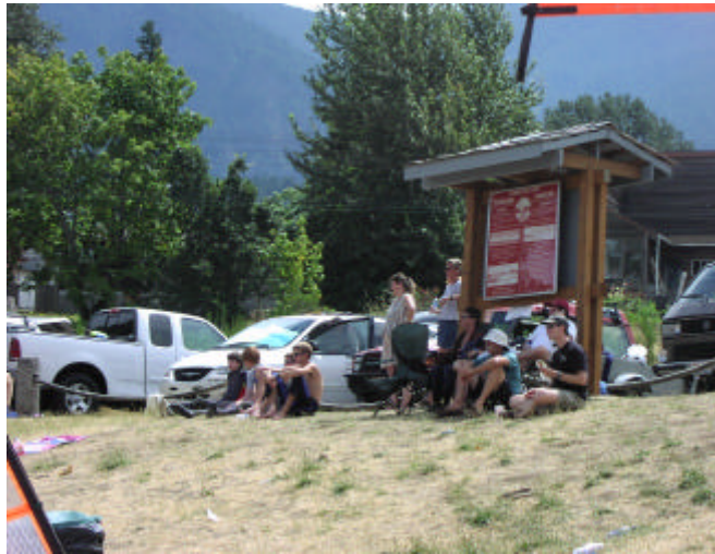
The current beach bulletin board is well-used for posting sailing instructions, race results, and other necessary information.