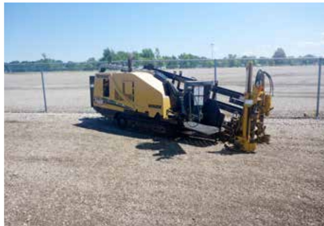
Vermeer D16X20 Series II