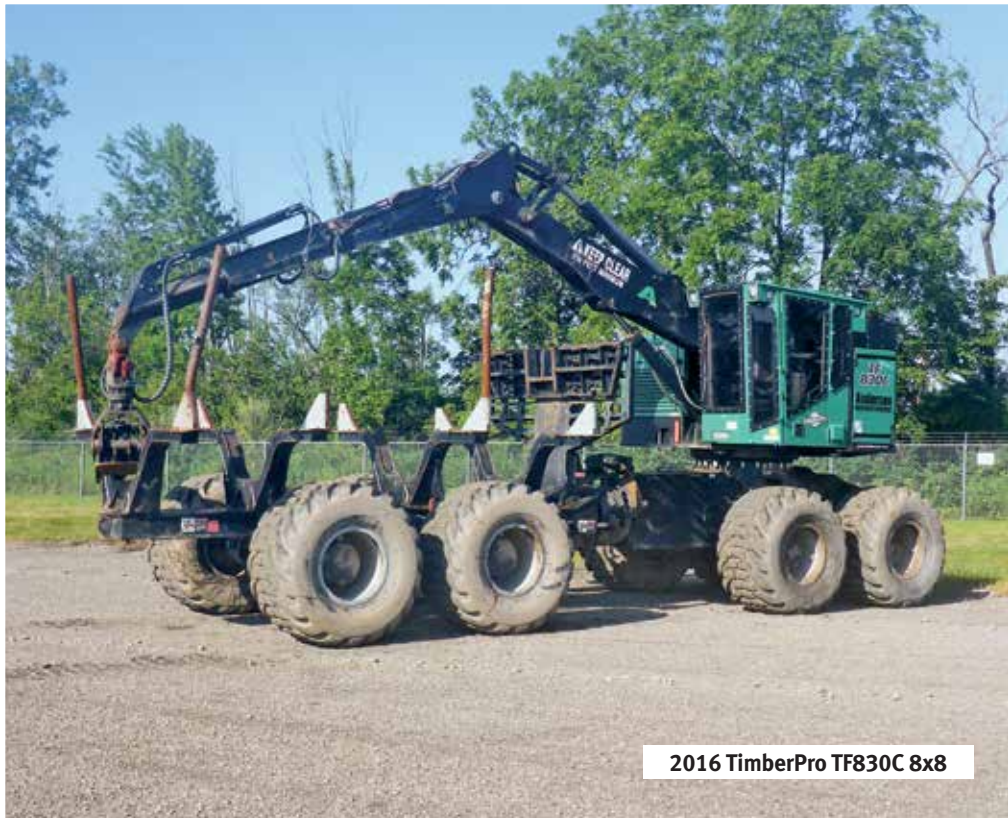
2016 TimberPro TF830C 8x8