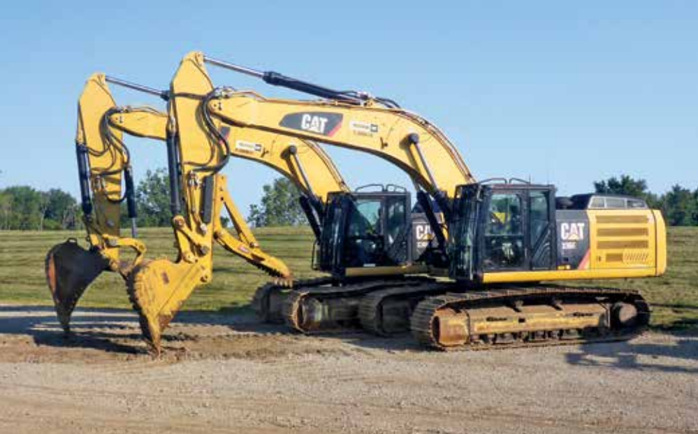
2 – 2014 Caterpillar 336EL