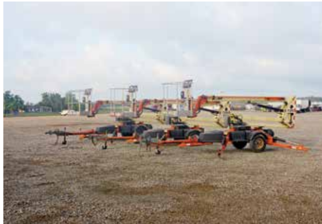
3 - 2013 JLG T350