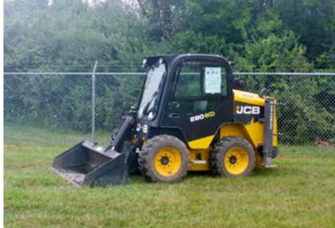
2012 JCB 280 2 Spd – Low meter hours