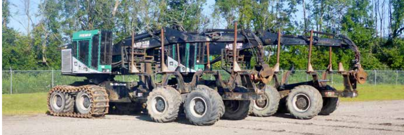
2 – TimberPro TF830B