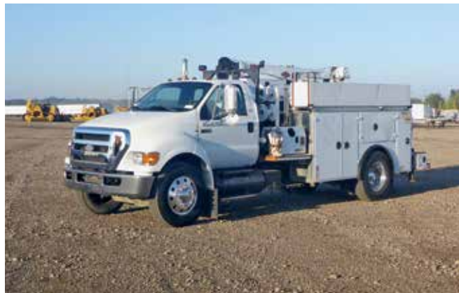
Ford F750 w/IMT 5016

See complete auction and equipment information on our website