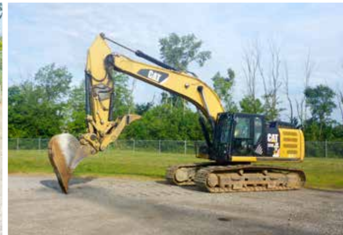
2012 Caterpillar 329EL