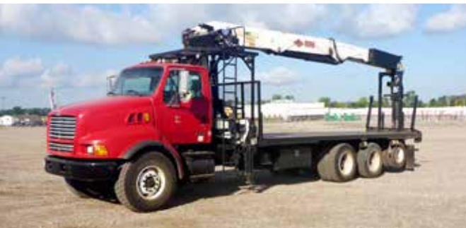
Sterling LT9500 w/IMT 24562 5500 Lb