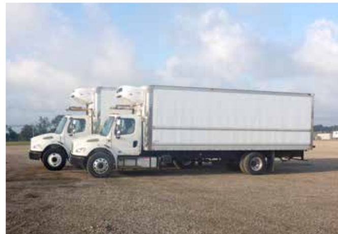
2 – 2013 Freightliner M2106