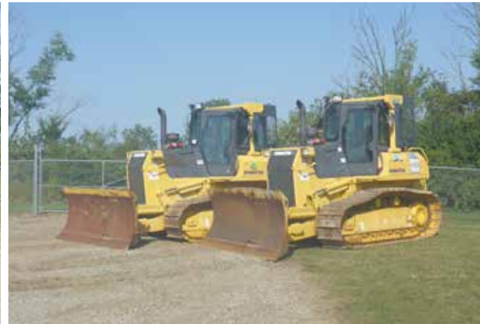
2 - 2011 Komatsu D61PX-15EO