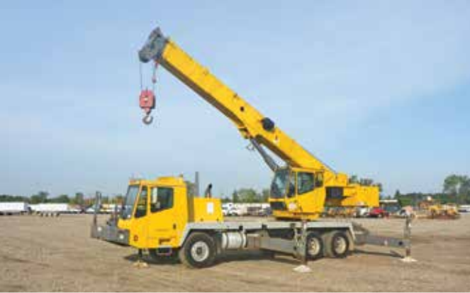
Grove TMS540E 40 Ton 6x4