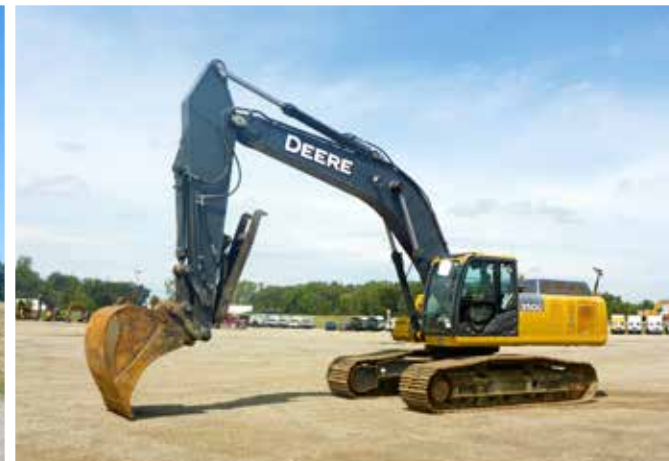
1 of 4 – John Deere 350G LC