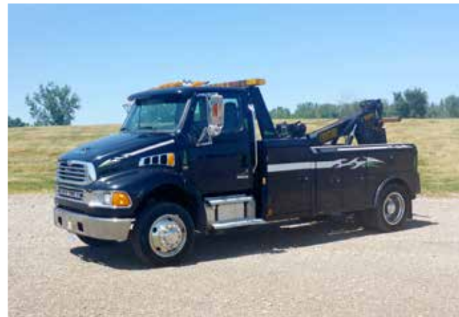
Sterling Acterra w/Century