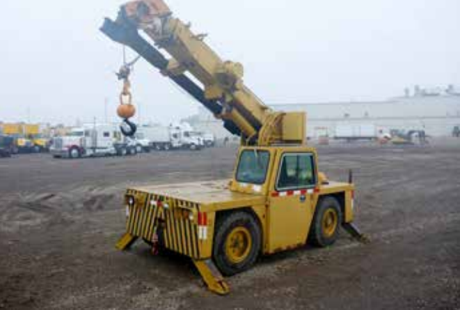
1 of 2 – Grove AP206