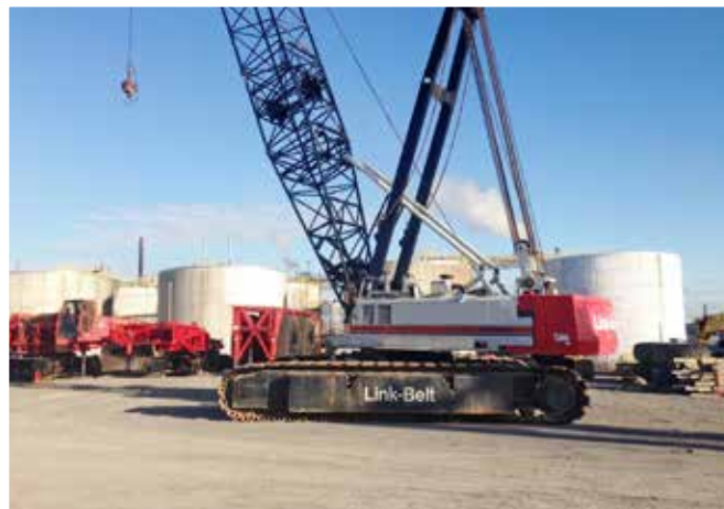
Link-Belt LS248H Series II 200 Ton