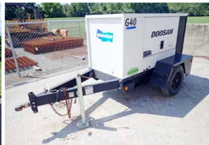
2012 Doosan G40