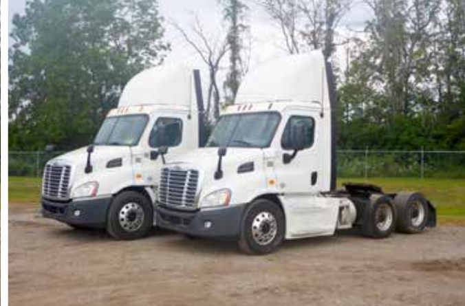
2 of 18 – Freightliner PX125064ST