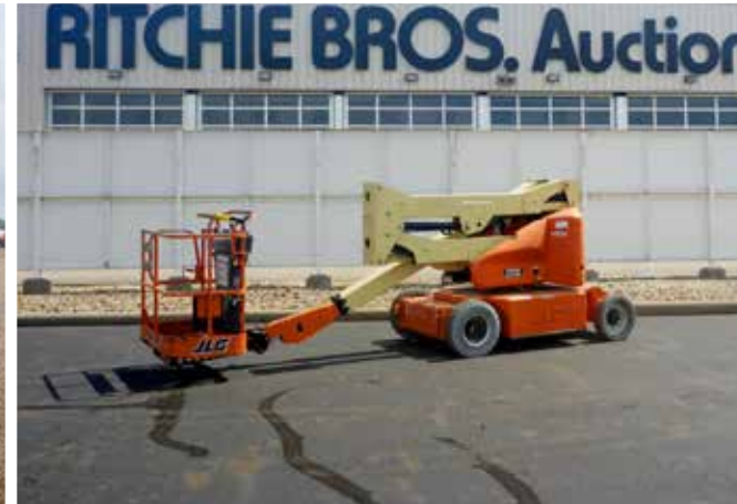
2012 JLG E400AN