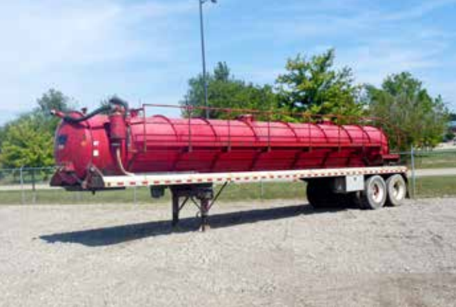
2012 Kruz 130 Barrel