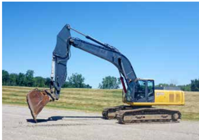
2011 John Deere 350D LC