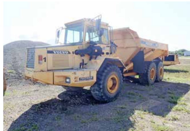
Volvo A30C 6x6