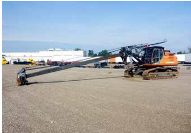
2010 Doosan DX225LL