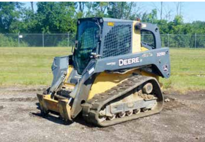
1 of 2 – 2012 John Deere 329D