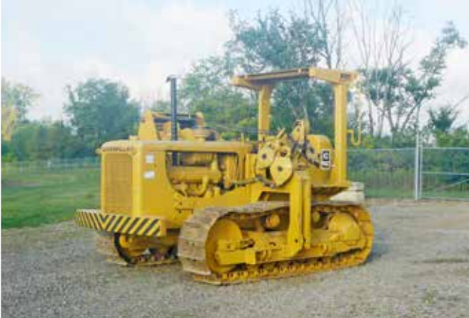
Caterpillar 561B w/2012 Midwestern 561