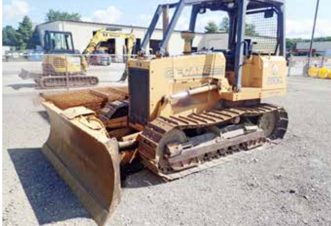
Case 850G LT