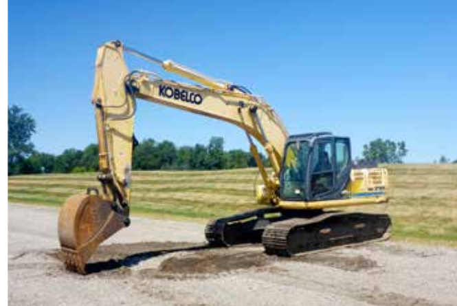
2011 Kobelco SK210-8E