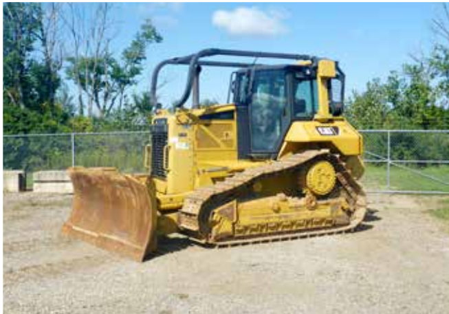
1 of 2 - Caterpillar D6N XL