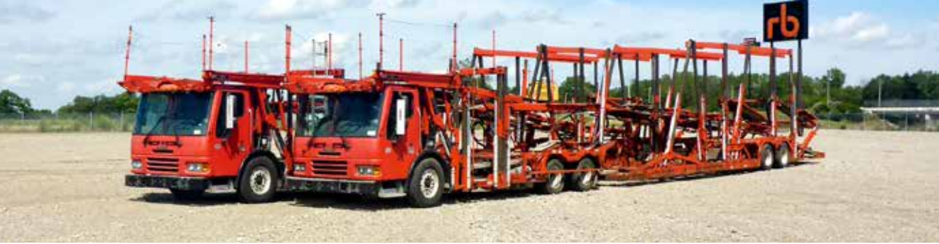
2 – 2012 American LaFrance w/2013 Cottrell CX11HCSD