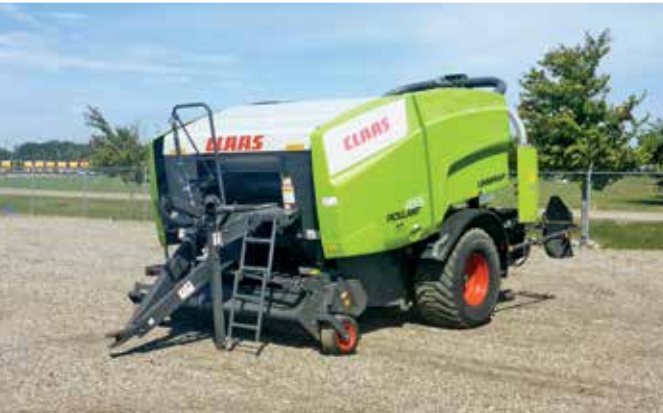
2014 Claas 455 Rollant Uniwrap Round