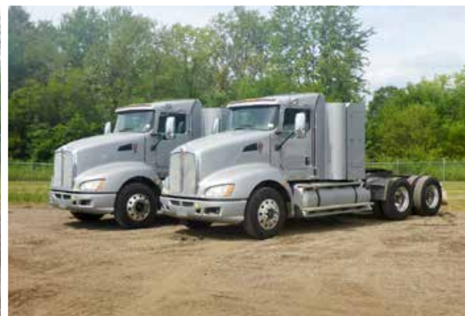
1 of 2 – 2015 & 2014 Kenworth T660 CNG