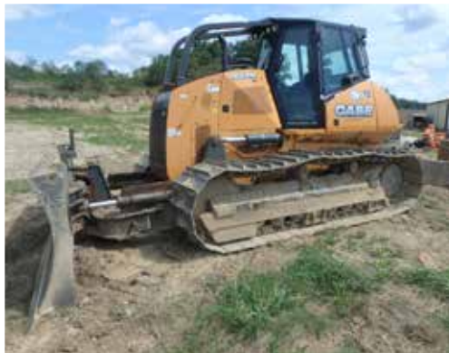
2015 Case 1650M WT