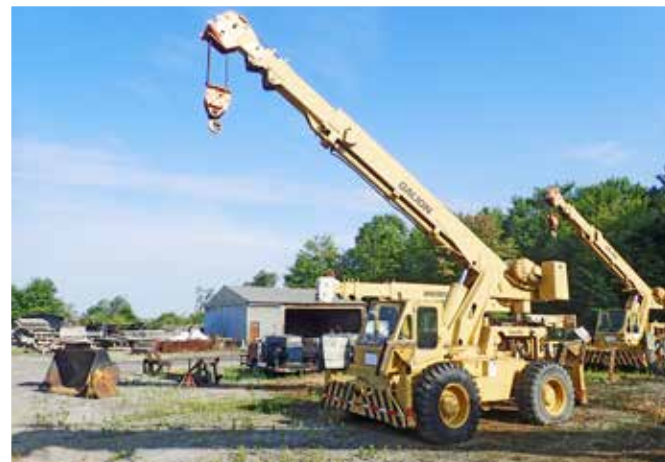
1 of 2 - Galion 150FA