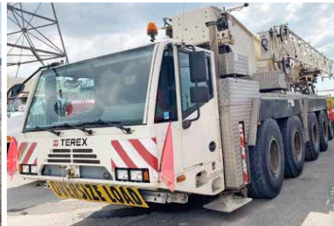
Demag AC80-2 100 Ton