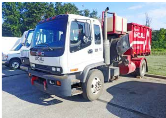
GMC T7500 w/Leach Vacall