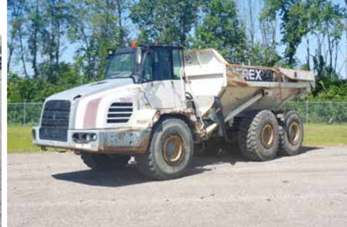
Terex TA30 6x6