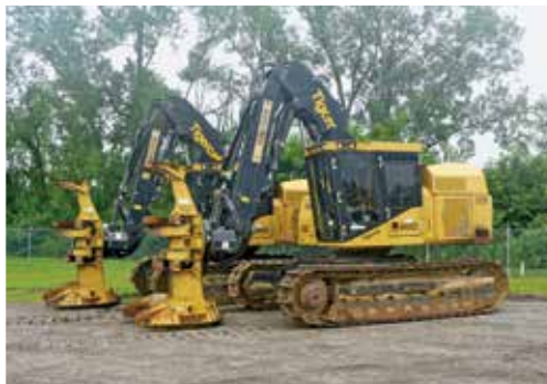
2 – 2014 Tigercat 845D