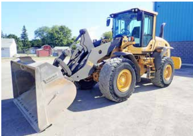
2012 Volvo L70G