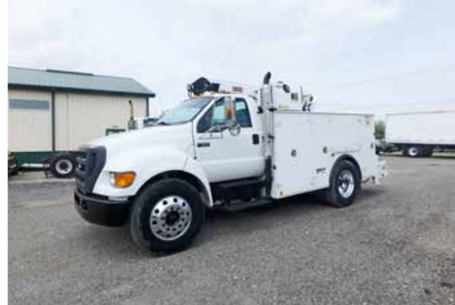
Ford F650 w/IMT 3820