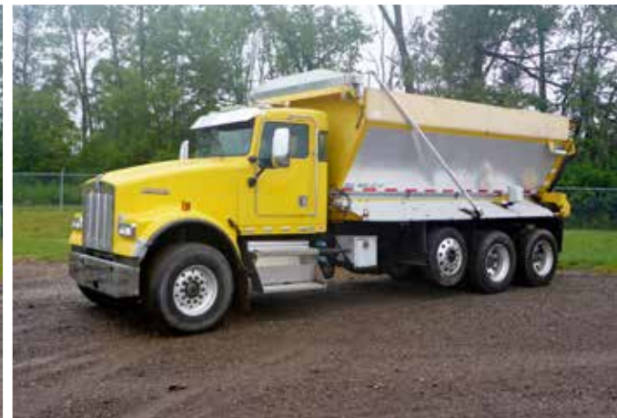
Kenworth W900 Live Bottom