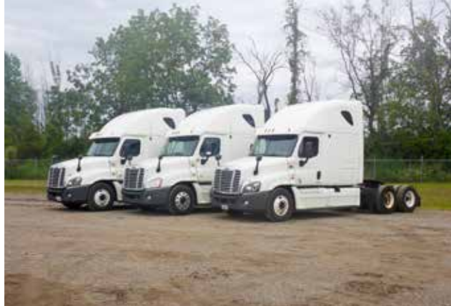
3 of 35 – Freightliner PX125064ST