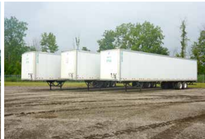
3 of 5 – 2015 Vanguard VXP 53 Ft