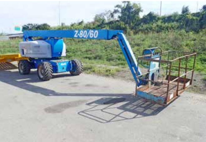
Genie Z80/60 4x4