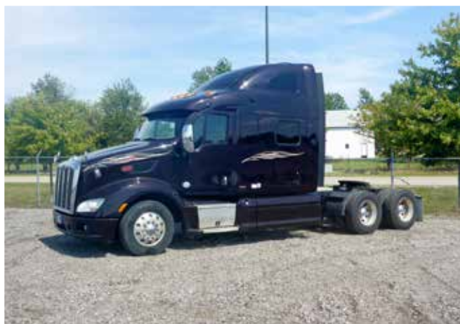
1 of 2 – 2015 Peterbilt 587