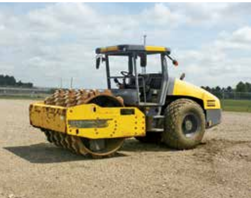
2014 Dynapac CA2500D