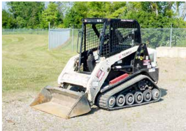
1 of 8 – Terex PT30