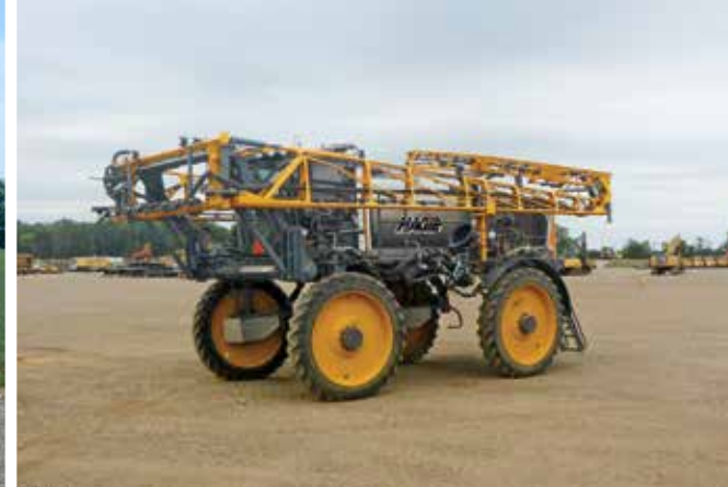
2013 Hagie STS10 90 Ft 4x4