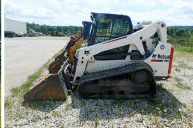
1 of 2 – Bobcat T650