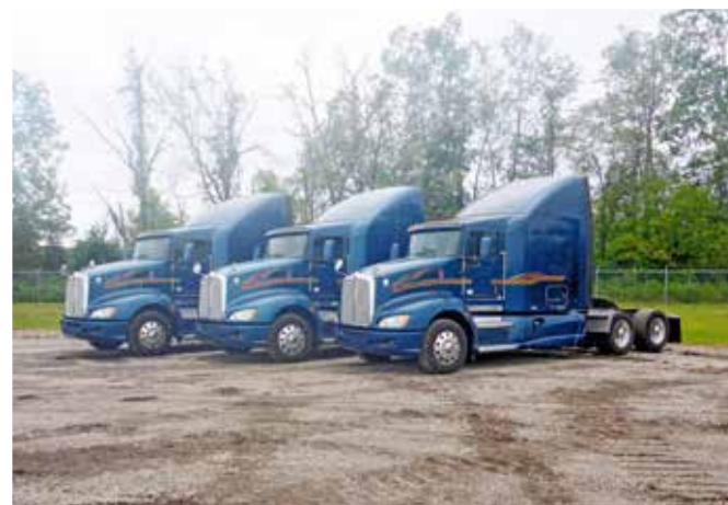
2 of 3 – 2014 & 1 of 2 – 2013 Kenworth T660