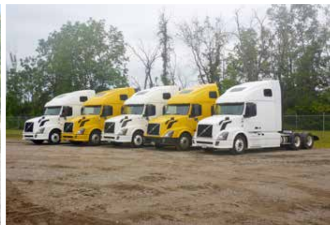
3 – 2014 & 2 of 8 – 2013 Volvo VNL64670