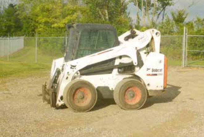
2016 Bobcat S750