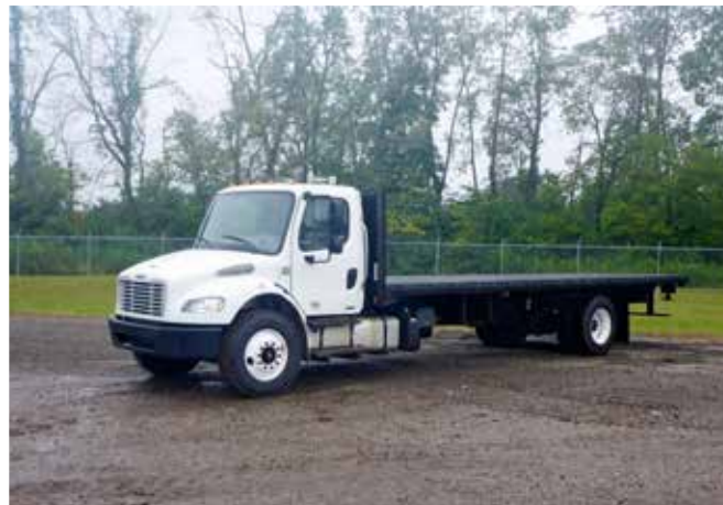
2012 Freightliner M2106