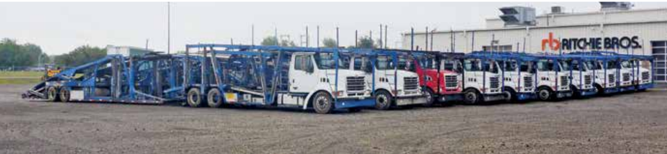
10 – Sterling LT9500CH w/Cottrell