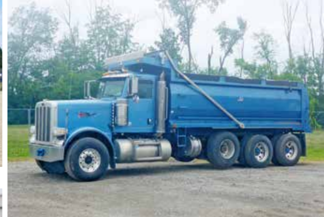
2015 Peterbilt 389