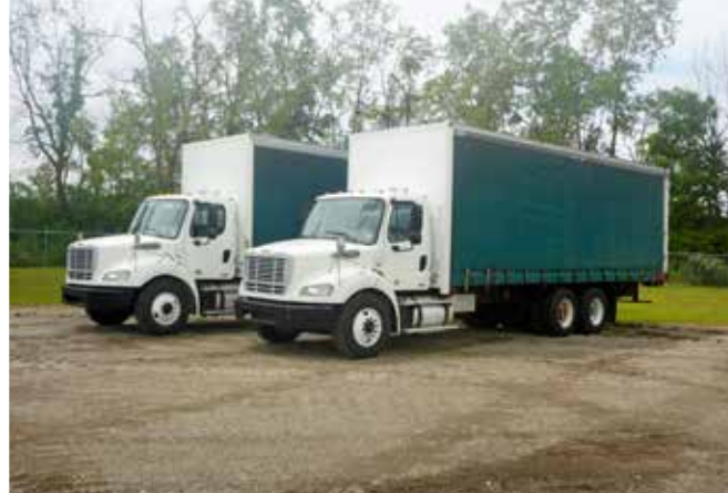
2 – 2012 Freightliner M2112