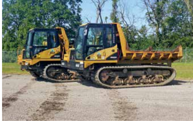
2011 Morooka MST3000VD & 2011 Morooka MST2200VD