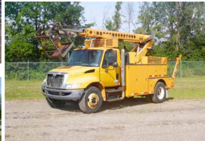
International 4400SBA w/Telsta T40C