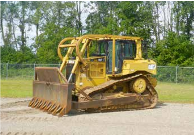
Caterpillar D6T XL