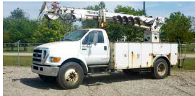
Ford F750 w/Telect Commander C4047