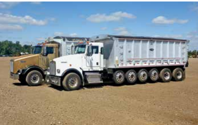
2 – Kenworth T800