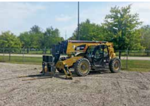
2015 Caterpillar TL1255D 12000 Lb 4x4x4