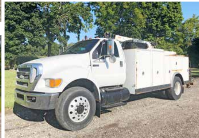
1 of 2 – Ford F750 w/Auto Crane 8406H