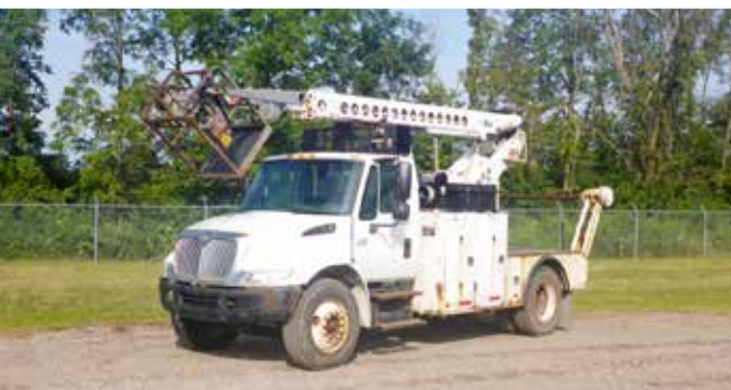
1 of 3 – International 4300 w/Altec