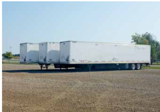
3 of 22 – 2013 Great Dane CLA131409053 53 Ft