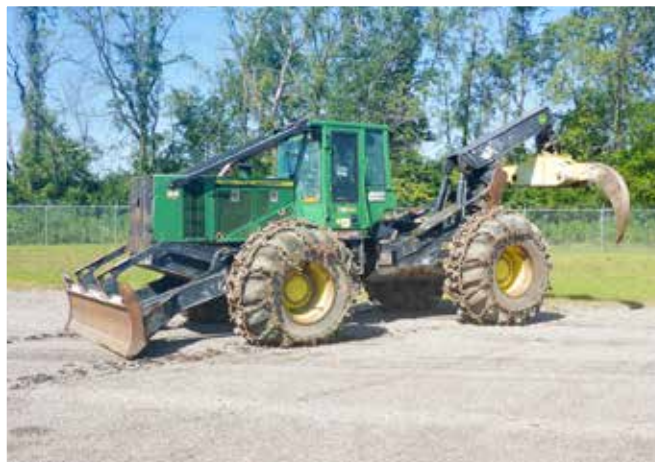
2011 John Deere 748H