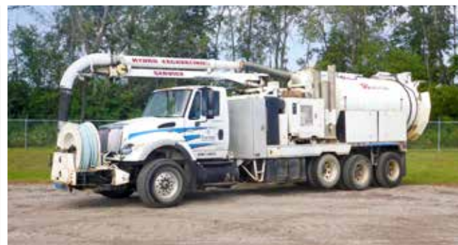
International 7600SFA w/Vac-Con