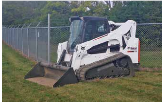
2013 Bobcat T750 2 Spd High Flow