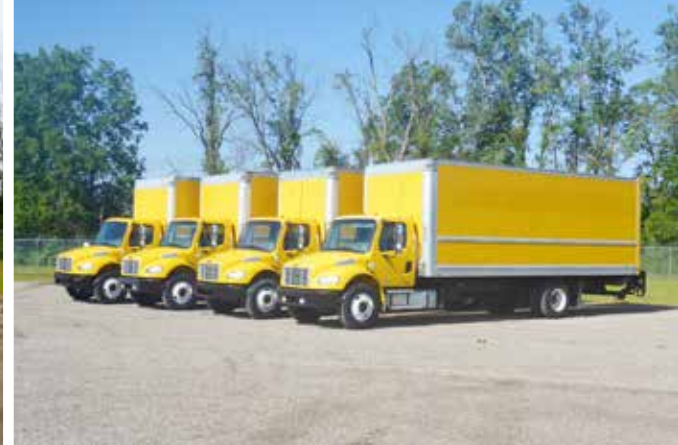
4 of 25 – Freightliner M2106