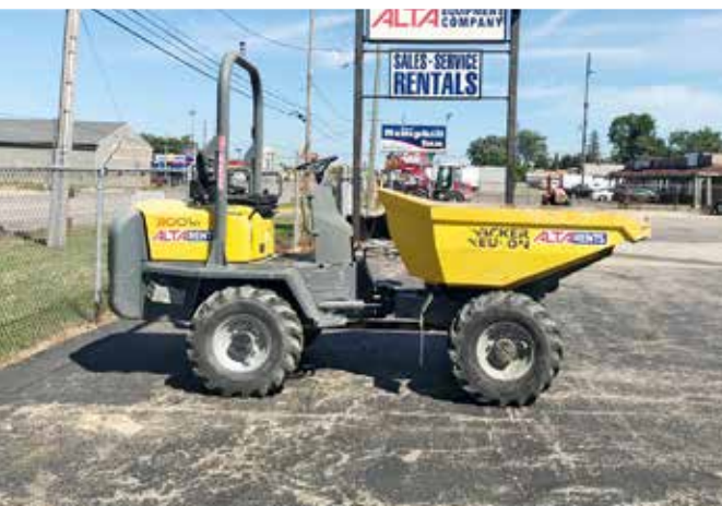
2015 Wacker 3001