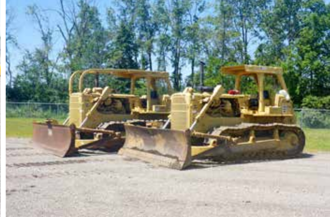
2 - Caterpillar D8K