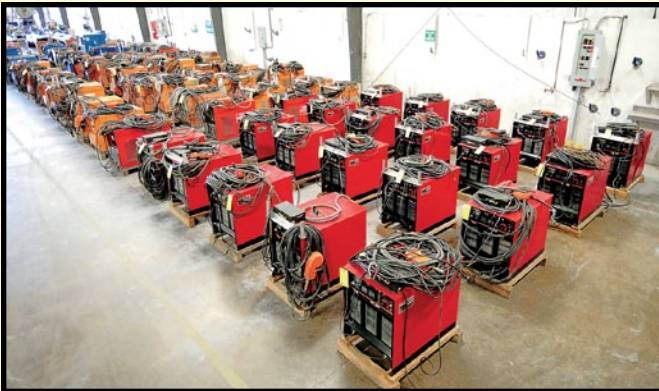
PARTIAL VIEW OF MIG WELDING MACHINES