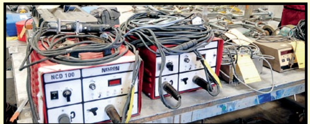
(2) NELSON MDL. NCD100 STUD WELDERS