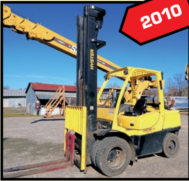
HYSTER 8,500 LB. CAP. MDL. H90FT LPG FORKLIFT