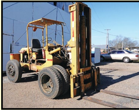
(1 OF 2) WINDHAM 12,000 LB. CAP. ROUGH TERRAIN DIESEL FORKLIFTS