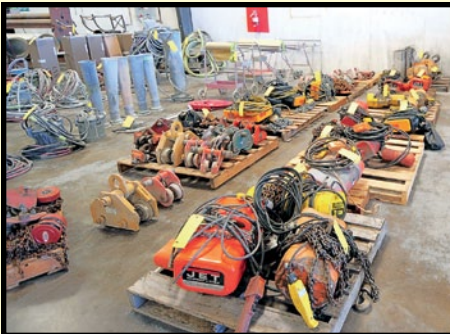
PARTIAL VIEW OF LARGE QTY. HOISTS

LARGE QUANTITY OF ELECTRIC CHAIN HOISTS up to 4 T. cap. by Jet, Kone, CM and Budgit—most w/trolleys; (12) 67"W. X 46"L. X 55" DP. SCRAP HOPPERS ; COOLTECH MDL. 304288 AIR CONDITIONING SERVICE CART , hoses, gauges and accessories (photo page 5); DIGITAL CRANE SCALE .