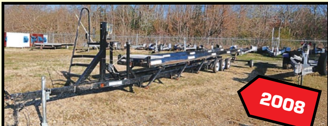
B&M MFG. MDL. LD-PTU TRIPLE AXLE 26' PONTOON TRAILER