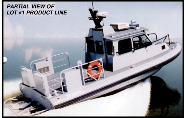
PARTIAL VIEW OF LOT #1 PRODUCT LINE

For Product Line Technical Information, contact sales@seark.com For a Sealed Bid Form, contact the auctioneer at 800-282-8466