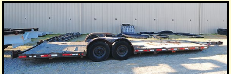
24' L LOW PROFILE FLATBED TRAILER

HONDA ALL TERRAIN VEHICLE , 4-wheel, front mtd. winch.