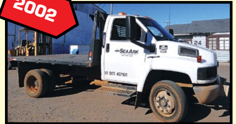
CHEVROLET C5500 8' FLATBED TRUCK

At the Premises of SEARK MARINE, INC. A MILITARY & INDUSTRIAL WORK BOAT MANUFACTURER 404 N. Gabbert Street MONTICELLO, AR 71655 (See Directions on Back Page)