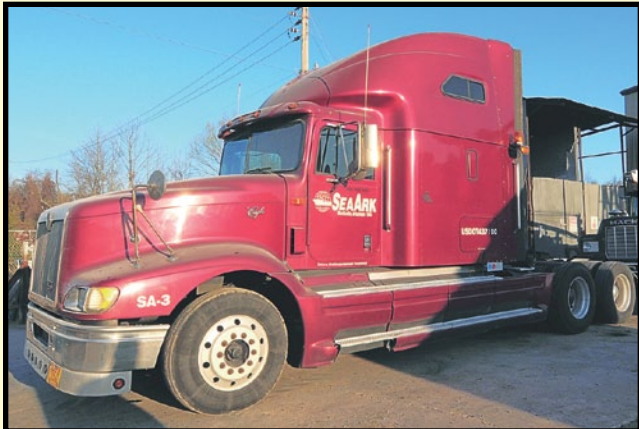
NAVISTAR EAGLE MDL. 94006X4 TRUCK TRACTOR