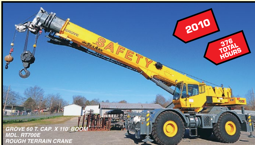
GROVE 60 T. CAP. X 110' BOOM MDL. RT700E ROUGH TERRAIN CRANE

Featuring Grove RT700E Rough Terrain Crane new in 2010; P&H 15 T. Cranes; Huge Quantities of Raw Material & Boat Piece Parts Inventory; W.I.P. incl. (2) 40' Hulls; Fab Equip. incl. Huge Qty. Welders; Truck Tractors & Rolling Stock; Forklifts; Boat Trailers; Power Tools; More!!!