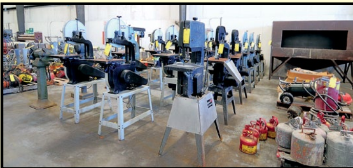
(18) DELTA VERTICAL BANDSAWS

At the Premises of SEARK MARINE, INC. A MILITARY & INDUSTRIAL WORK BOAT MANUFACTURER 404 N. Gabbert Street MONTICELLO, AR 71655 (See Directions on Back Page)