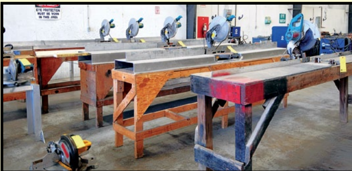
PARTIAL VIEW OF DEWALT AND MAKITA CHOP SAWS