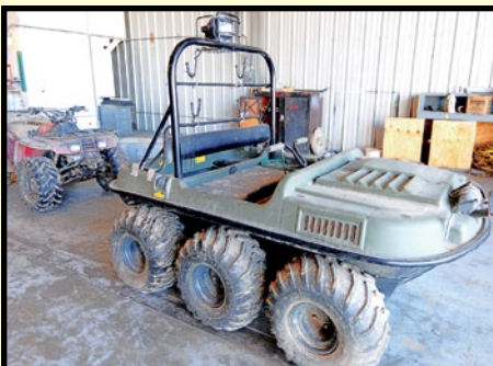
ARGO MDL. VE698-58 AMPHIBIOUS VEHICLE

YACHT CLUB "HAWKEYE" 4,600 Lb. CAP. MDL. 2035TB , VIN 4H100212050163630.