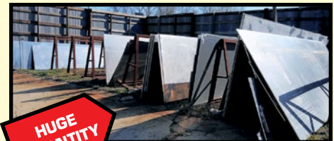
SAMPLE VIEW OF RAW MATERIAL INVENTORY