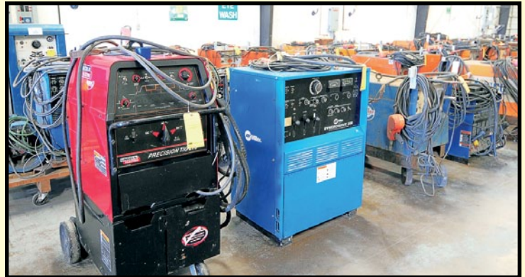
PARTIAL VIEW OF TIG WELDING MACHINES