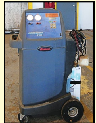
COOLTECH A/C SERVICE CART

On-Site Bidding in Monticello, AR or Bid Via Webcast at BidSpotter.com