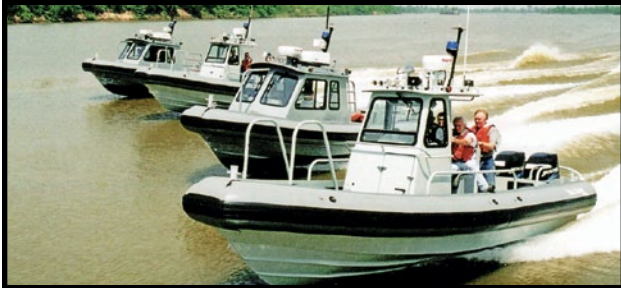
PARTIAL VIEW OF LOT #1 PRODUCT LINE