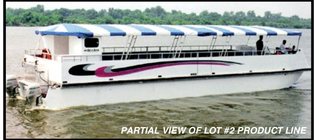
PARTIAL VIEW OF LOT #2 PRODUCT LINE