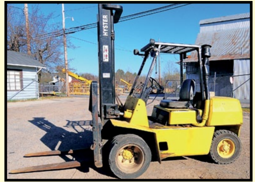
HYSTER 4,000 KG (8,800 LB.) CAP. DIESEL FORKLIFT