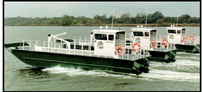
PARTIAL VIEW OF LOT #2 PRODUCT LINE