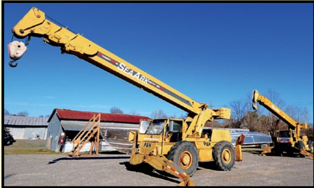
(2) P&H 15 T MDL. RT150 ROUGH TERRAIN CRANES

INSPECTION: Wednesday, April 17, 9:00 A.M. to 4:00 P.M. & Morning of Sale