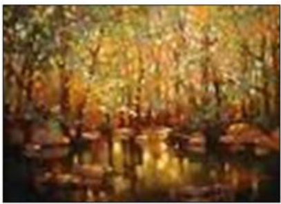
Teresa Saia—Workshop: "Expressions of Light" Presented by Peninsula Art League Fall of 2016—September 23, 24 & 25