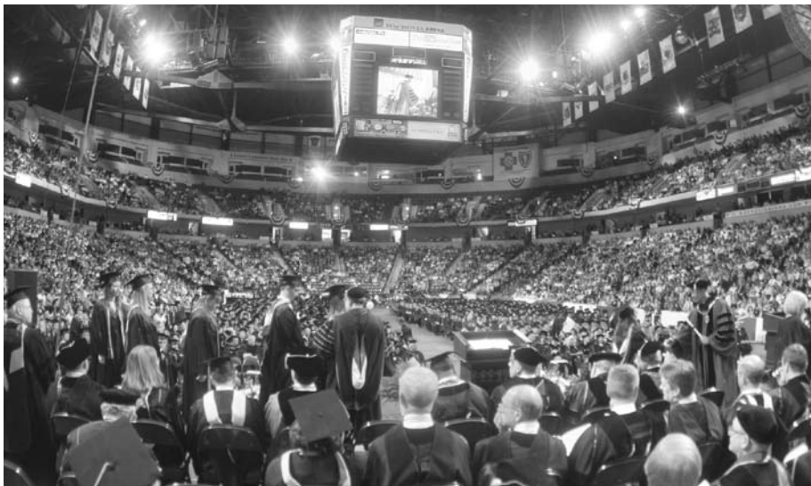
833 bachelor's and associate's degrees were conferred at the undergraduate commencement ceremony at Wachovia Arena on May 25.

Commencement 2008 activities were marked by two major celebrations, as the University celebrated its 120th anniversary with the largest-ever graduating class in its history.