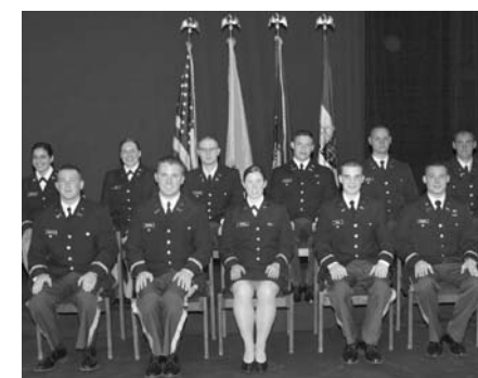
Eleven ROTC Army cadets were commissioned as second lieutenants in the U.S. Army during a ceremony held in the Royal Theater, McDade Center for Literary and Performing Arts, on May 24.