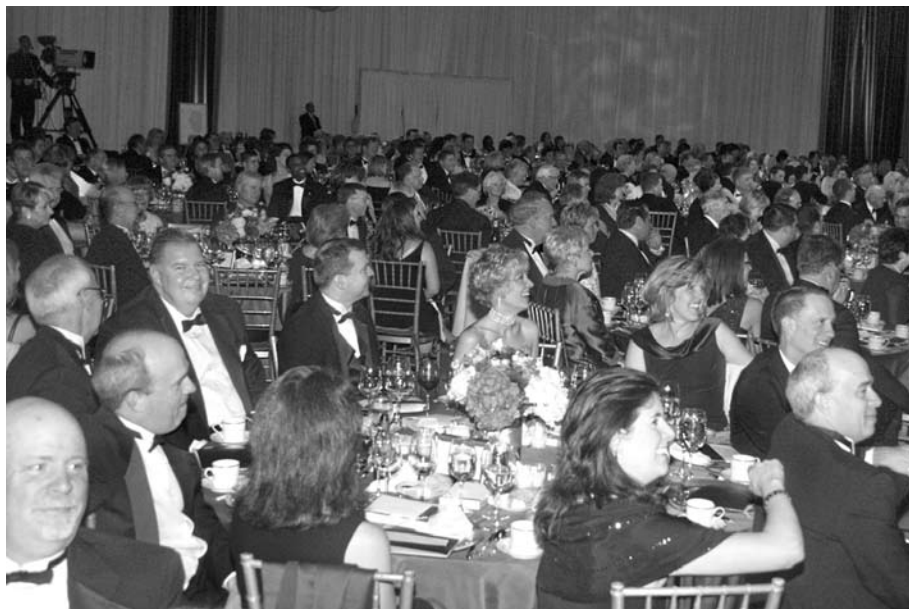
About 450 people attended the black-tie announcement of the Pride, Passion, Promise Campaign held on April 26 in the transformed Byron Complex.

At an April 26 gala held on campus, the University unveiled a capital campaign of unprecedented magnitude that will transform the campus and secure the future of this 120-year-old Catholic and Jesuit university.