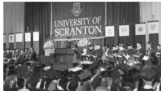
A record number of post-baccalaureate degrees were conferred during a ceremony for the College of Graduate and Continuing Education held in the Byron Recreation Complex on May 24.

For a listing of graduates and additional coverage of Commencement activities, see pages 4-6.