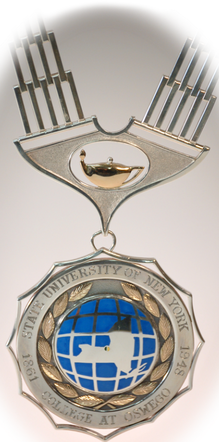
The College Medallion