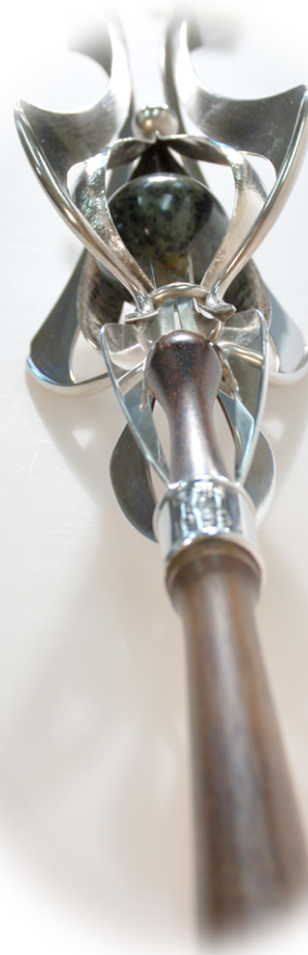
The College Mace