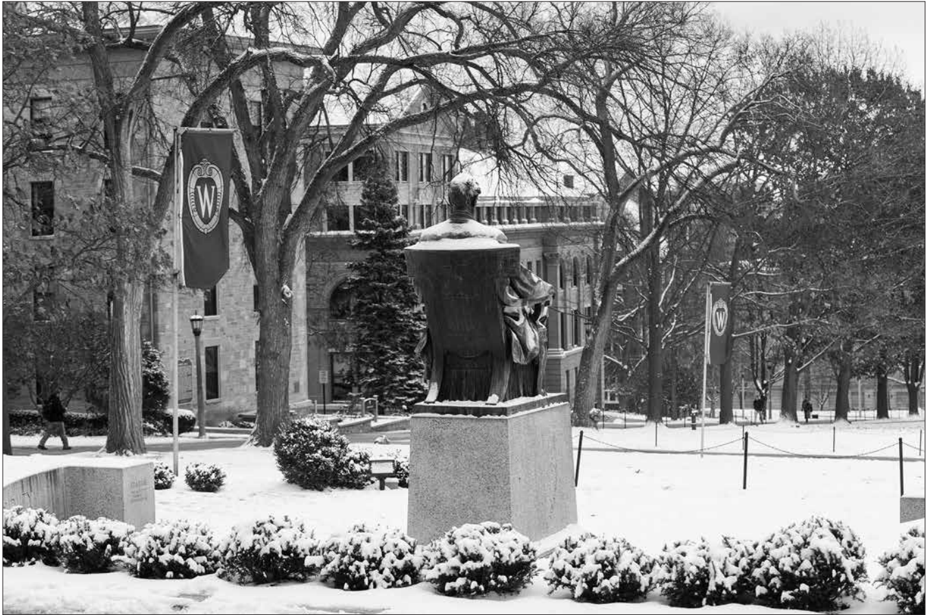
Cover: Bascom Hall during a winter snowstorm.