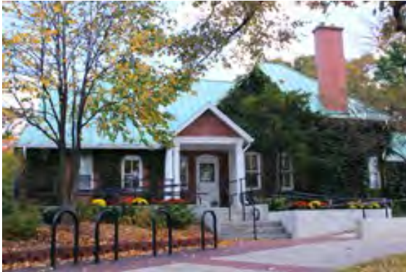
Leisure Center entrance.