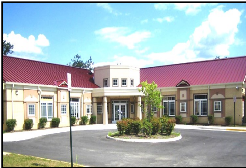
James L. & Juliette McNeil Preschool Academy in Fairfax County, Virginia