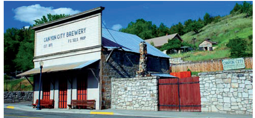
Oregon State Archives