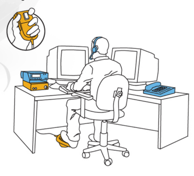
Plantronics Headsets are also available