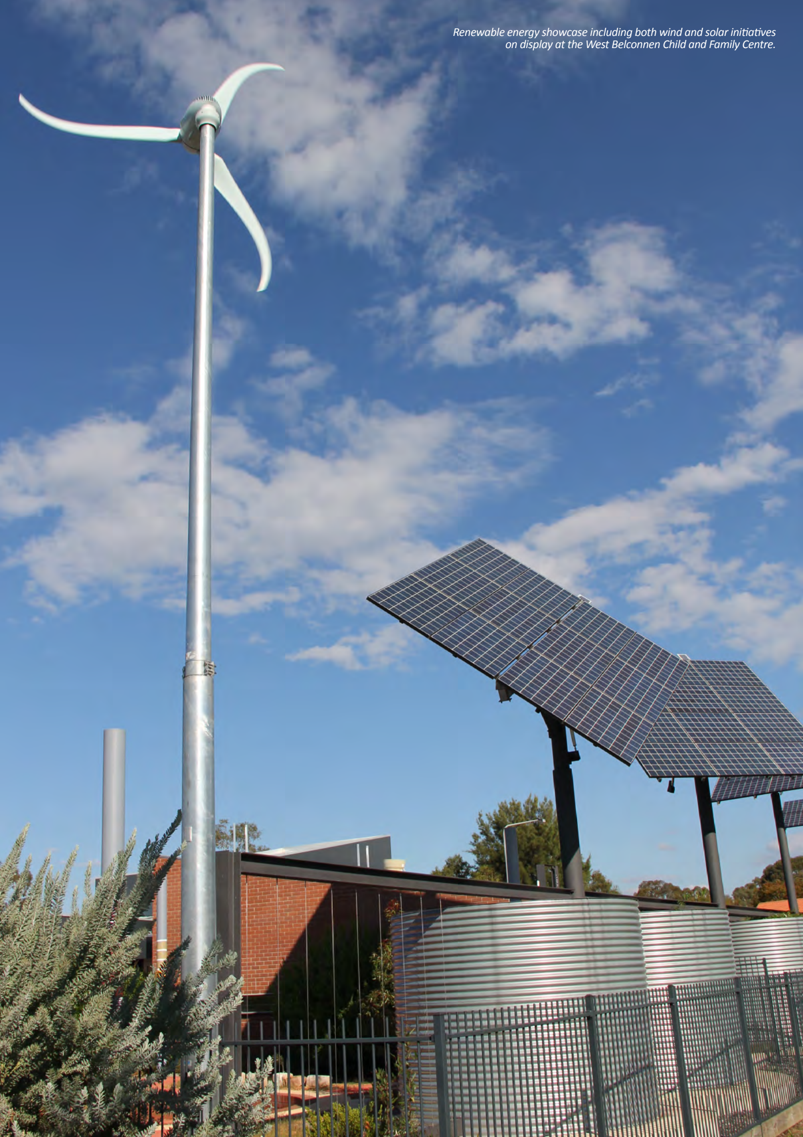
Renewable energy showcase including both wind and solar initiatives on display at the West Belconnen Child and Family Centre.