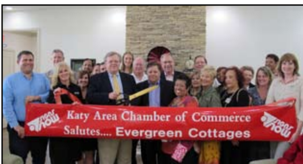
May 2 – Evergreen Cottages 21715 Bridgewater Village Drive