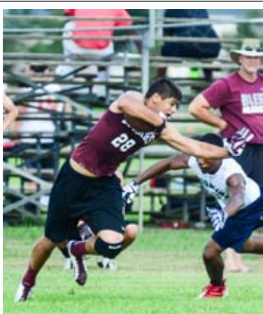
Cinco Ranch kicked its offense into high gear on Saturday to win the Viking 7on7 Tournament and earn a spot in the upcoming 2013 State 7on7 Tournament. The Cougars averaged 40.2 points in five games at Dulles.

On Saturday, Cinco Ranch will host its annual 7on7 tournament as the season regular 7on7 season draws