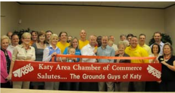
May 9 – The Grounds Guys of Katy Katy Area Chamber of Commerce Office