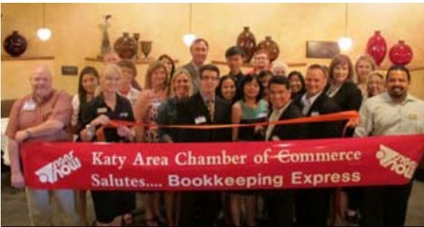
May 29 – Bookkeeping Express Hasta La Pasta 1450 W. Grand Parkway South