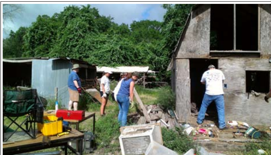
St. Peter's members tore down a building on the property of Halter, Inc., an equestrian therapy organization for children with disabilities and at-risk teens. The group took time out to relocate a mother opossum and her babies before demolishing the building.

In addition to Church Without Walls, St. Peter's has a monthly mission focus, collects food for a food pantry on the first Sunday of each month, sponsors a group of students and adults who do home repairs through U.M. ARMY and is involved in a variety of international missions in countries such as Jamaica, Ecuador, Honduras and Guatemala.