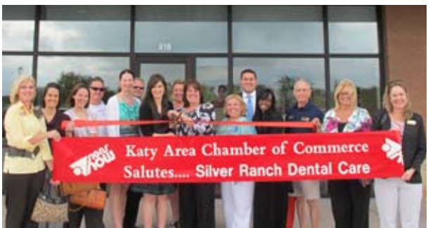
May 15 – Silver Ranch Dental Care 9550 Spring Green Blvd., Ste. 410