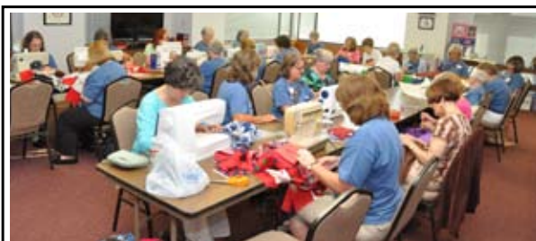
Fourteen prayer quilt tops were completed during Church Without Walls at St. Peter's. These quilts, when completed, will be prayed over by the Prayer Quilt Ministry team and then sent to individuals who are going through a difficult time such as illness or the death of a loved one.