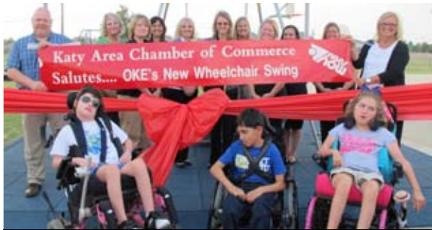
May 22 – Kilpatrick Elementary Wheelchair Swing 21600 Cinco Ranch Blvd.