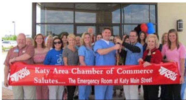
May 1 – The Emergency Room at Katy Main Street 25765 Katy Freeway