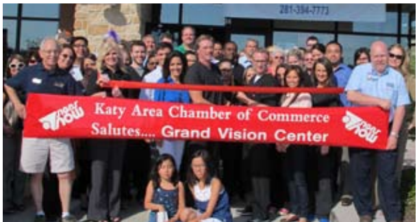
May 7 – Grand Vision Center 9550 Spring Green Blvd.