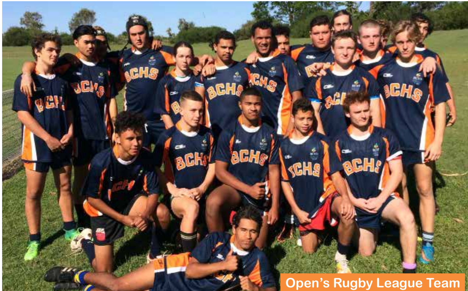
Open's Rugby League Team