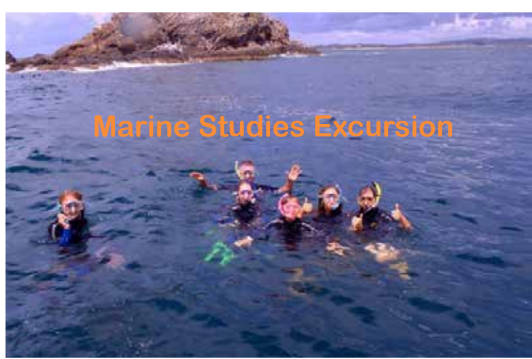
Marine Studies Excursion