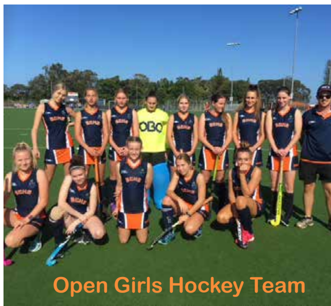
Open Girls Hockey Team