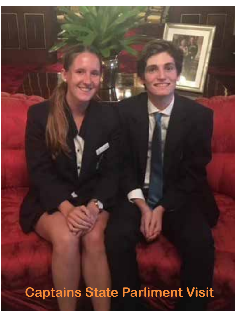
Captains State Parliment Visit