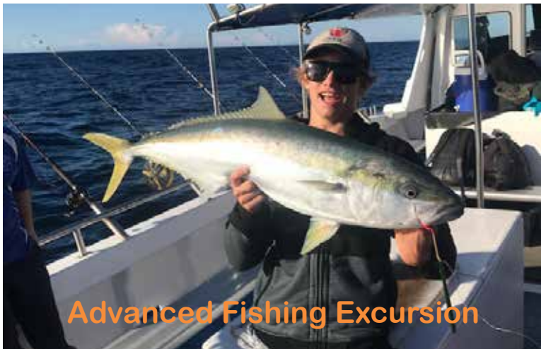
Advanced Fishing Excursion