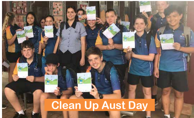
Clean Up Aust Day