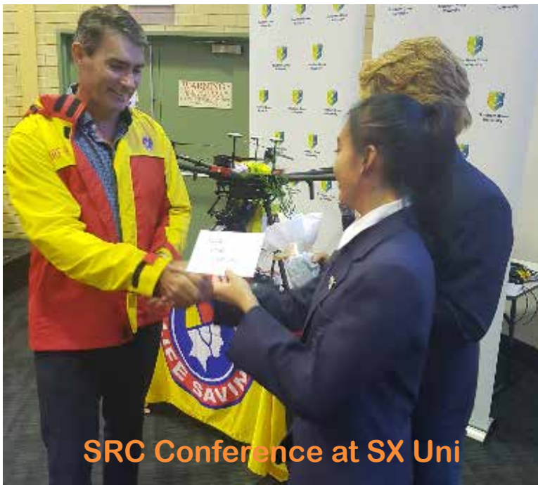
SRC Conference at SX Uni