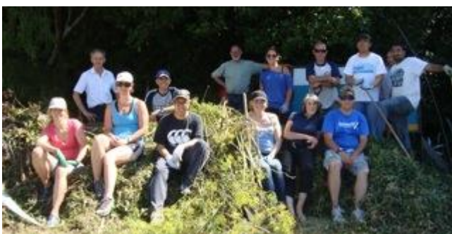
Kiwibank Volunteer Group