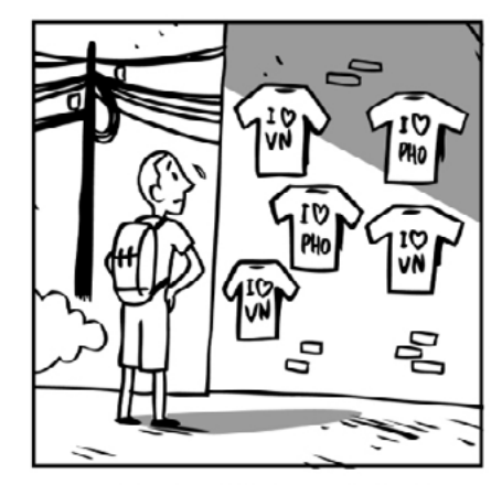
2006 - One frenchy guy was traveling in Vietnam, but could not find high quality t-shirts with cute designs to bring home. The idea was born.