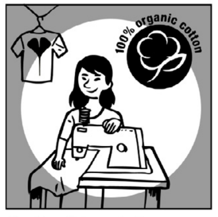
Meantime, their passion for environment and fair trade are the keys of Ginkgo's business philosophy and success.