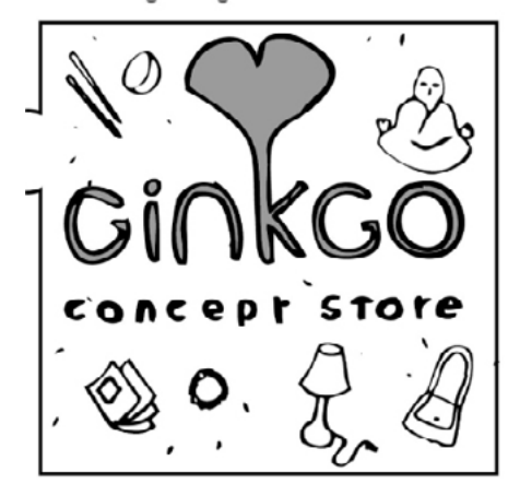
Ginkgo Concept Store was born early May 2013, in De Tham street, Saigon. And the adventure continues...