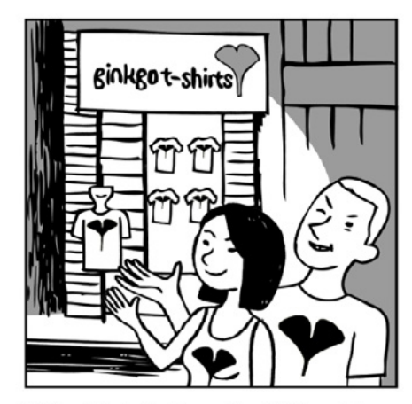
With a big help from his girlfriend, they opened the first Ginkgo T-shirts shop, 6 square meters, in Pham Ngu Lao street, Saigon, on the 8th of August 2007.