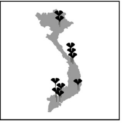
Today, Ginkgo t-shirts has 10 stores throughout Vietnam, and employs many people.