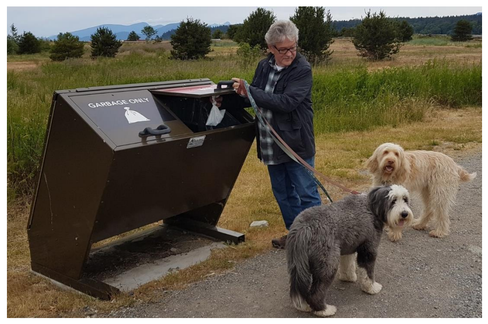
Figure 1. A pet owner puts his pet's waste in a designated bin.

Currently, pet owners can use any type of bag to pick up their dog's waste and then place the bagged waste in a red labelled recycling bin. These bins are usually found alongside other waste bins (figure 1). Metro Vancouver has engaged residents to sort their waste for many years and, especially because dog waste receptacles are next to other waste receptacles, there is a low barrier to participation for pet owners.