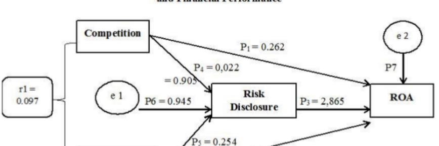
Figure 1 Path Analysis of Competition, Independent Commissioner, Risk Disclosure and Financial Performance