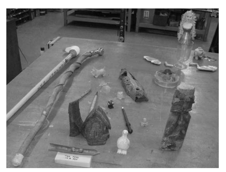
Top of Maine Submitted by Annette Tardy