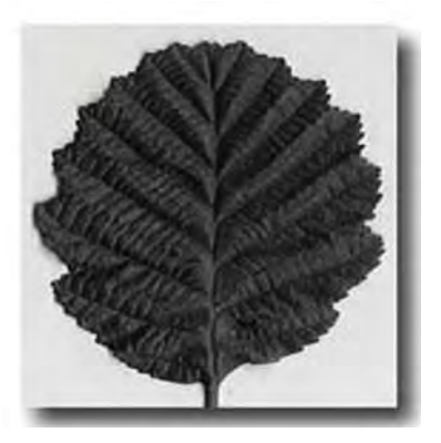
March 18 - April 14

If you are an Alder sign within the Celtic tree astrology system, you are a natural-born pathfinder. You're a mover and a shaker, and will blaze a trail with fiery passion often gaining loyal followers to your cause. You are charming, gregarious and mingle easily with a broad mix of personalities. In other words, Alder signs get along with everybody and everybody loves to hang around with you. This might be because Alder's are easily confident and have a strong self-faith. This self-assurances is infectious and other people recognize this quality in you instantly. Alder Celtic tree astrology signs are very focused and dislike waste. Consequently, they can see through superficialities and will not tolerate fluff. Alder people place high value on their time, and feel that wasting time is insufferable. They are motivated by action and results. Alder's pair well with Hawthorns, Oaks or even Birch signs.