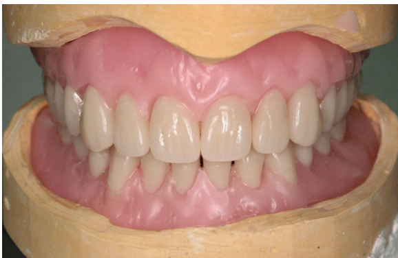
Fig. 16 - Tooth try-in on articulator.