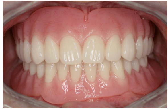
Fig. 18 - Finished dentures in situ.

The technique presented above was appropriate and successful in this case. Its use depended upon a correct assessment of the problem that needed addressing. If not applied correctly then it would be all too easy to perpetuate a