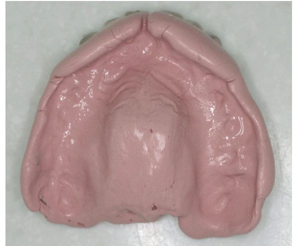
Fig. 13 - ZnOE wash in upper copy.

An open mouth technique is clinically easier to perform than a closed mouth technique the advantage of which it is thought will minimise changes in the OVD. In practice it is very difficult for the patient to occlude with precisely the correct force to avoid changes in the vertical dimension. Border moulding is also easier with the open mouth technique. If the OVD is recorded and checked at each