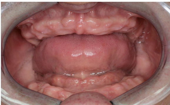
Fig. 1 – Edentulous ridges at approximate final vertical opening.

Examination of the static occlusion showed bilateral simultaneous contacts in maximum intercuspation (MI) which was coincident with retruded contact position (RCP). Examination of the dynamic occlusion showed that in protrusion there were only posterior contacts with no