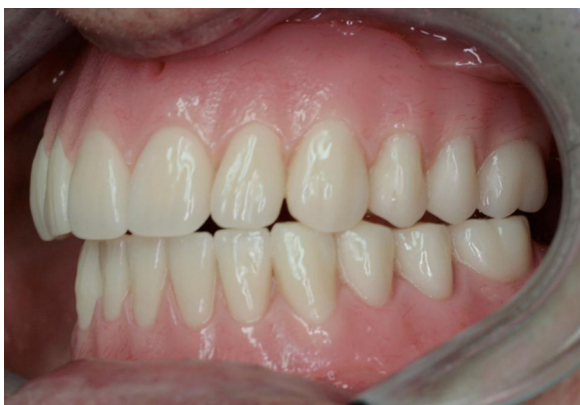
Fig. 22 – New dentures in left lateral excursion.