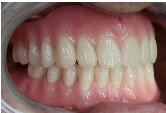
Fig. 23 – Balancing contacts on the right in left lateral excursion.

mix of alginate is mixed and loaded into the other half of the flask and the two halves closed. In order to avoid trapping air into the mould, alginate is preloaded into deep depressions or undercuts using a finger. Once set the flask is opened and the denture retrieved. Holes are cut into the heels of the mould for pouring cold cure acrylic resin.