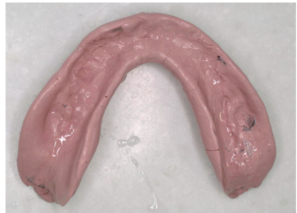
Fig. 14 - ZnOE wash in lower denture.

stage then as the occlusal surface is being changed, it is easy to keep control of this dimension.