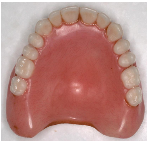
Fig. 8 – Current upper denture showing fracture palatal to upper centrals.

The treatment objective was to replicate the bucco-lingual tooth position and maintain the OVD. After 3 years post-extraction a degree of bone resorption was expected and hence a new fitting surface was indicated. The occlusal scheme was unsatisfactory and a balanced occlusion and articulation was to be developed necessitating a change in