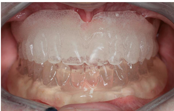
Fig. 12 - Acrylic copies in situ.

of material, reduce pressure build up and ensure a thin impression.