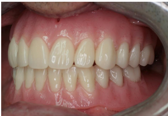
Fig. 21 – Balancing contacts on the left in right lateral excursion.