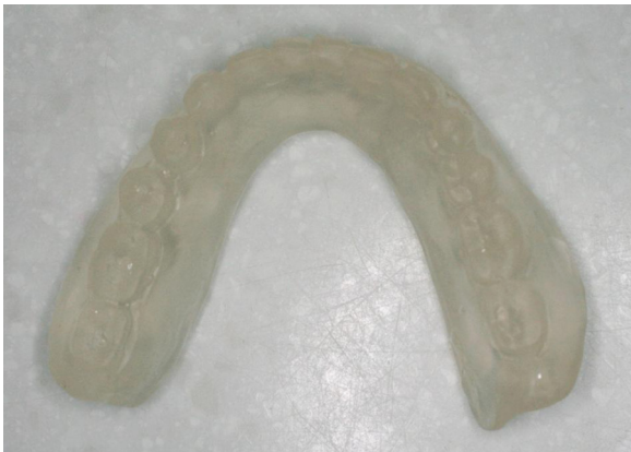
Fig. 11 - Acrylic copy of lower denture.