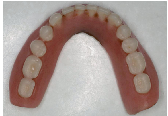
Fig. 9 – Current lower denture showing staining from smoking.

The treatment objective was to replicate the bucco-lingual tooth position and maintain the OVD. After 3 years post-extraction a degree of bone resorption was expected and hence a new fitting surface was indicated. The occlusal scheme was unsatisfactory and a balanced occlusion and articulation was to be developed necessitating a change in