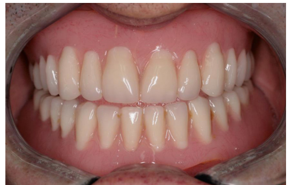
Fig. 5 – Current dentures in protrusion.

anterior contact (Fig. 5). Lateral excursions were canine guided and there were no non-working side (NWS) contacts (Figs. 6 and 7).