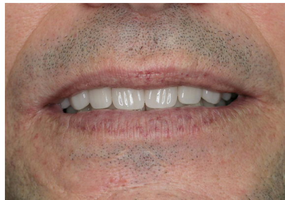
Fig. 24 – A satisfied patient.

mix of alginate is mixed and loaded into the other half of the flask and the two halves closed. In order to avoid trapping air into the mould, alginate is preloaded into deep depressions or undercuts using a finger. Once set the flask is opened and the denture retrieved. Holes are cut into the heels of the mould for pouring cold cure acrylic resin.