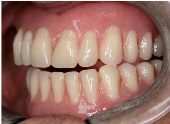
Fig. 7 – Current dentures in left lateral excursion.