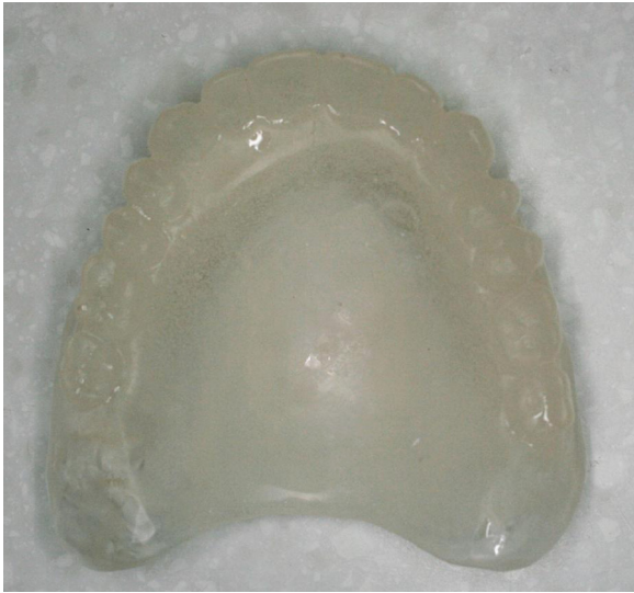
Fig. 10 - Acrylic copy of upper denture.