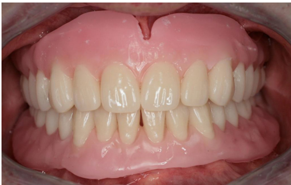
Fig. 17 - Tooth try-in in situ.

accurate tooth placement. In this case the contours of the polished surfaces were not critical and were replicated by hand carving the wax.