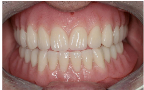
Fig. 19 - New dentures in protrusion.