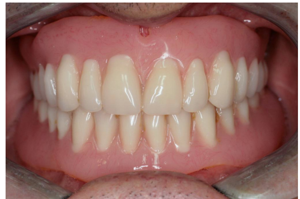
Fig. 4 – Current dentures in ICP.