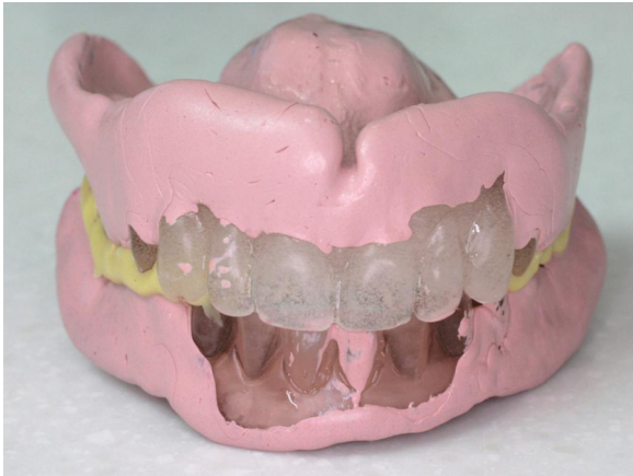
Fig. 15 - Jaw registration with silicone material.