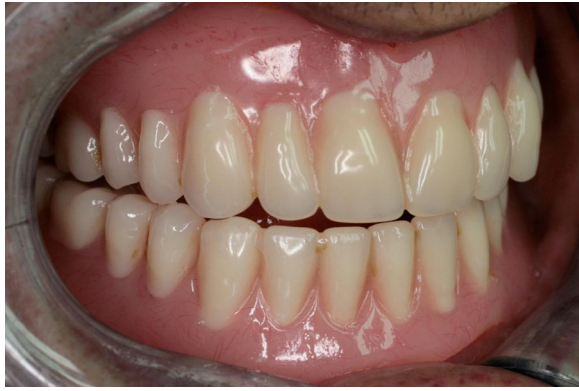
Fig. 6 – Current dentures in right lateral excursion.