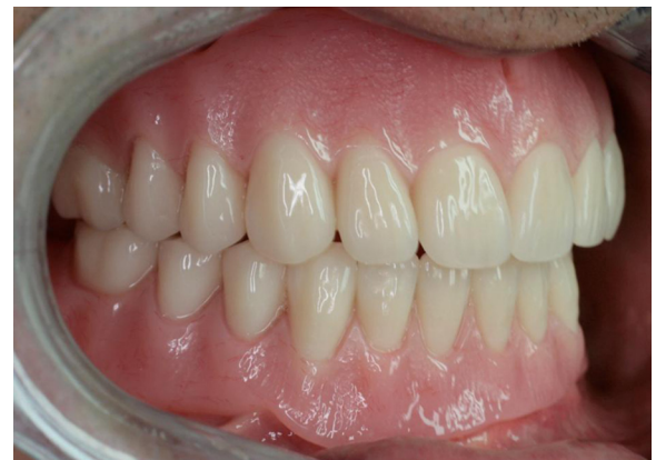
Fig. 20 - New dentures in right lateral excursion.

deteriorating denture situation. The technique has often been used incorrectly when the clinician is unable to correctly diagnose the denture fault with which the patient presents. In these types of cases, copies can be made of the dentures for trial modifications, such as extending borders, adding post-dams, balancing occlusion and increasing or reducing OVD. The patient's original dentures have not been altered in any way and so nothing is lost. Once the patient is happy with the modifications, then this is copied to make a definitive denture.