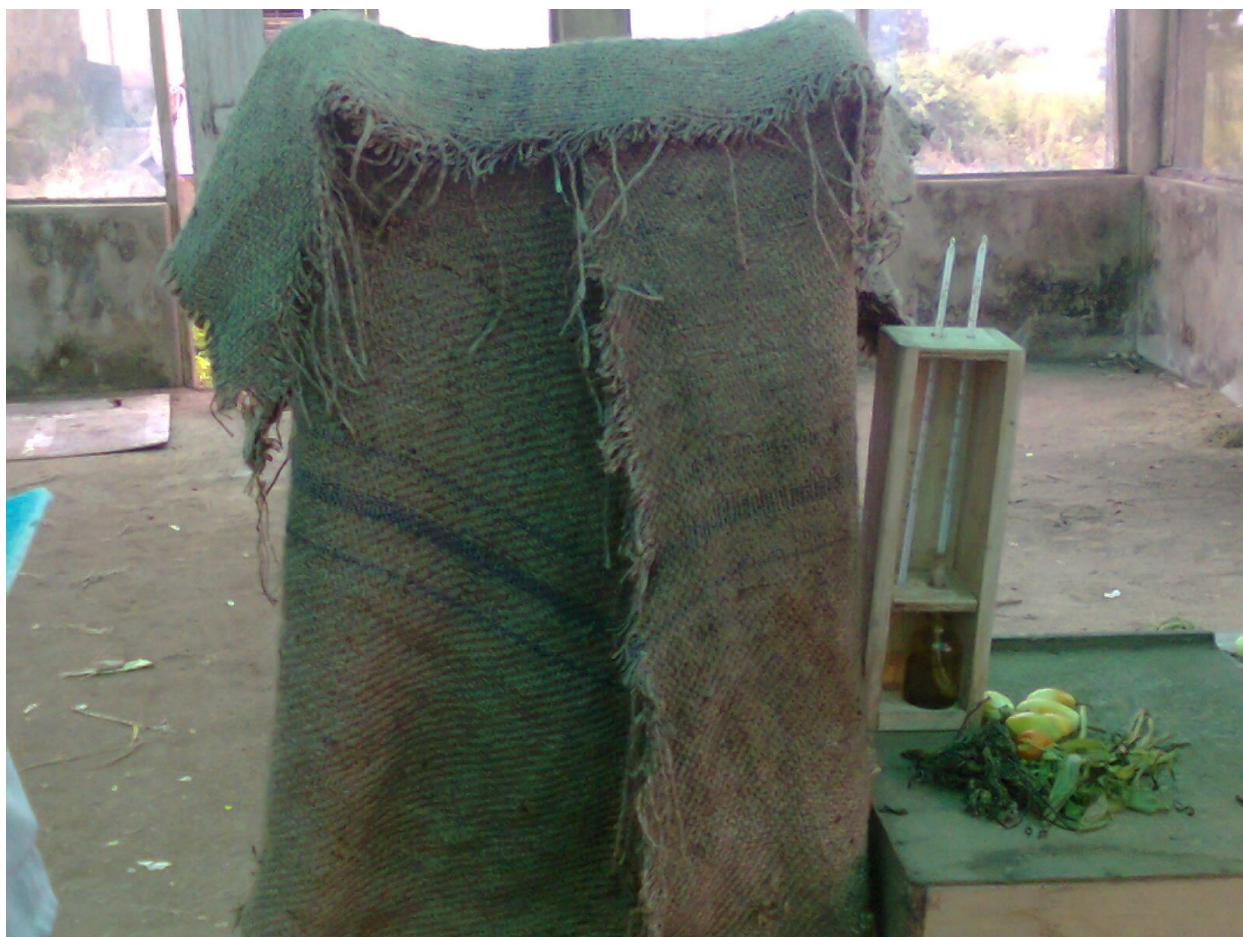
Figure 6. Locally Constructed Evaporative Cooler For Agric Produce Storage

Materials:- jute bag, trolley, hygrometer and weighing balance.