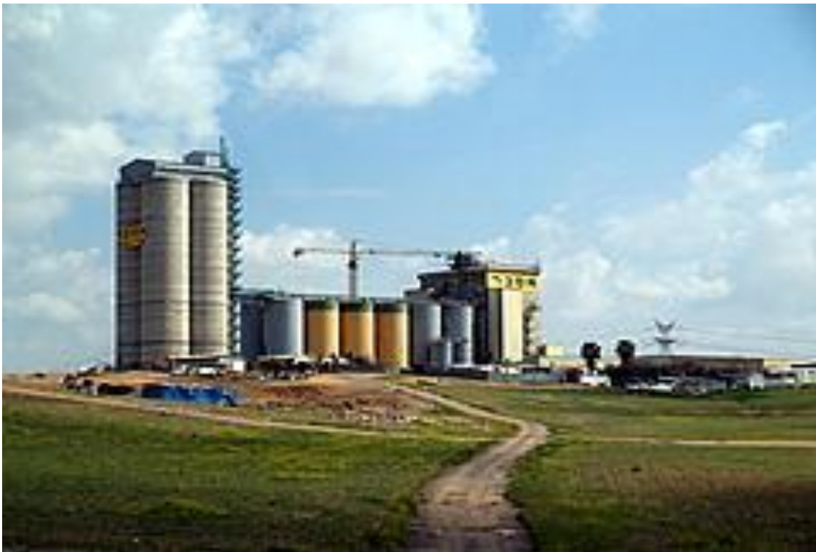
Figure. 1. Diagram of silo: a commercial storage equipment, the silos is connected to a grain elevator on a farm

This involves the used of large storage equipment and facilities for storage of agricultural products for man and industrial uses. It is of great importance since it make food available to consumers even during the off- season.