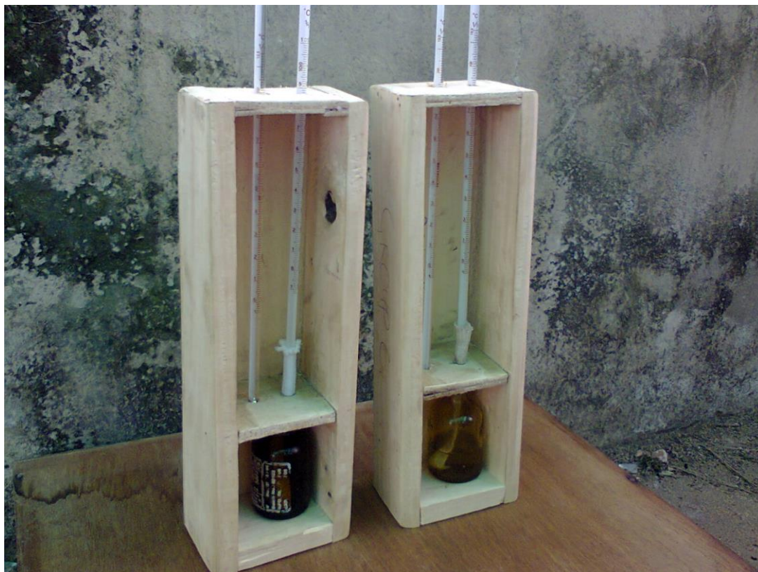
Figure 5. Locally constructed Hygrometer

Construction Of Hygrometer:- 2 hygrometer was constructed.