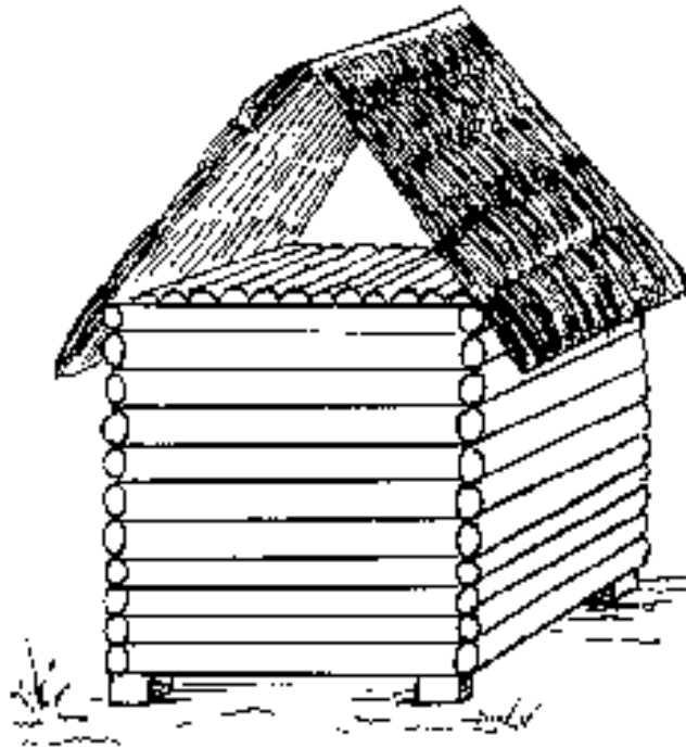
Figure 3. Bamboo Box