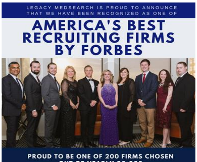
OUT OF NEARLY 20,000 Thank you to everyone who voted and supported us!

On behalf on my teammates and myself, we hope you find these resources helpful in your job search – or to hire for your team!