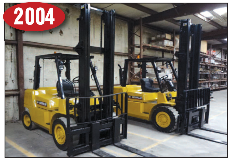
(2) 8,000 LB Caterpillar Model DP40K Diesel Pneumatic Tire Lift Trucks