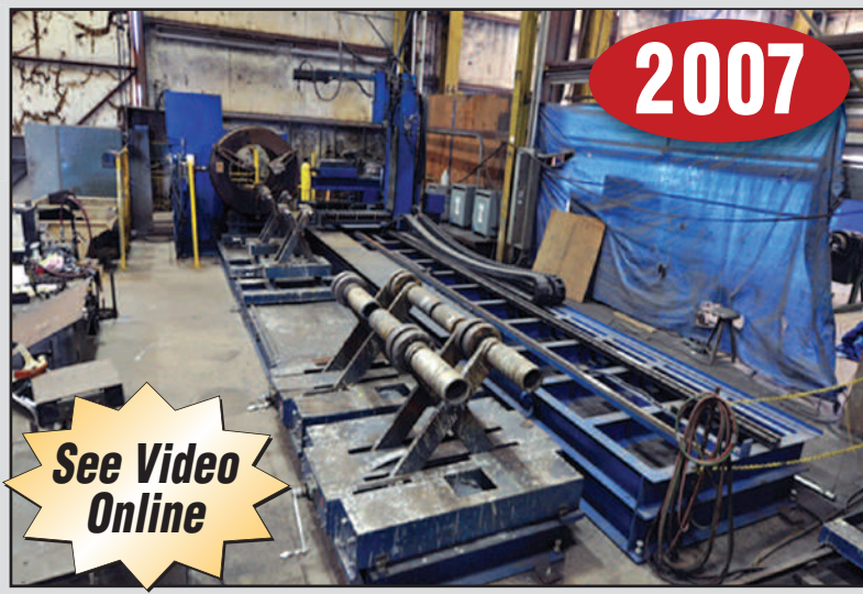
Pipe Coaster Model HID-1500MTS Six-Axis CNC Oxy Fuel / Plasma Pipe Profiling Machine