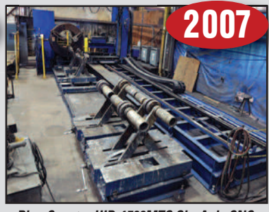
Pipe Coaster HID-1500MTS Six-Axis CNC Oxy Fuel / Plasma Pipe Profiling Machine