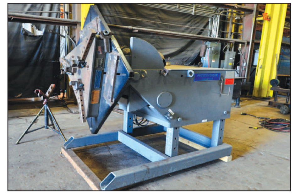
6,000 Lb. Preston Easton Mdl. PA60HD Welding Positioner