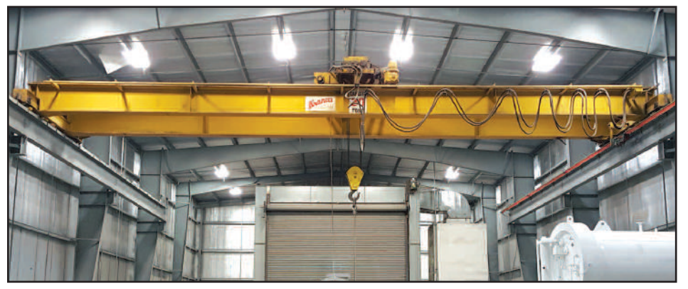
20-Ton x 50' Span Kranco Double Girder Top Running Overhead Bridge Crane