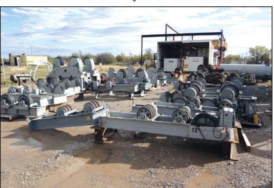
View of Tank Turning Rolls