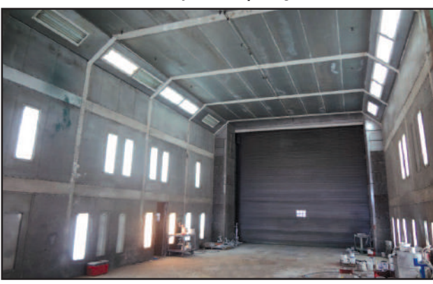
25' Wide x 47' Long x 25' H Col-Met Drive-Thru Paint Booth