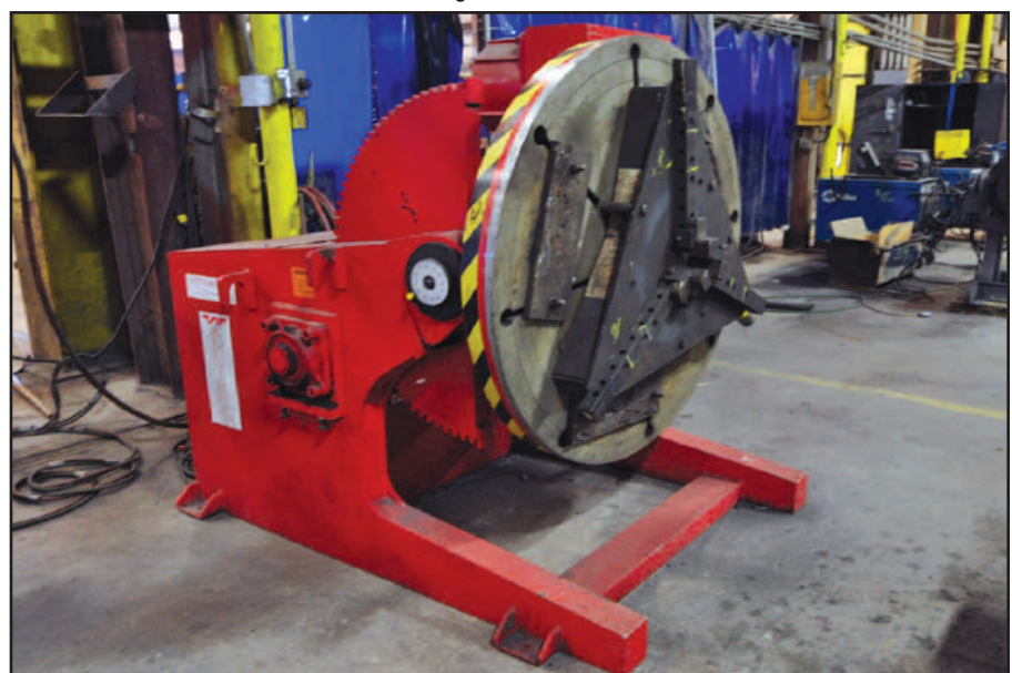
10,000 Lb. Weldwire Mdl. WPT-100 Welding Positioner