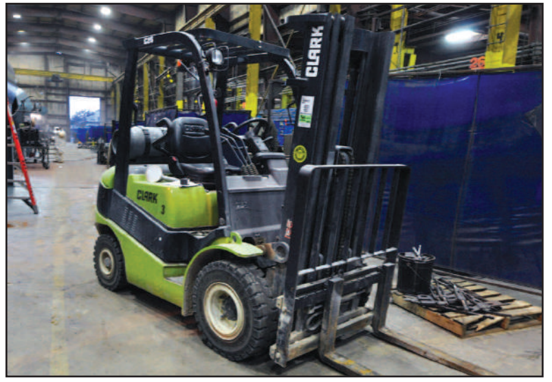
5,000 LB Clark Mdl. C25L LP Gas Pneumatic Yard Tire Lift Truck