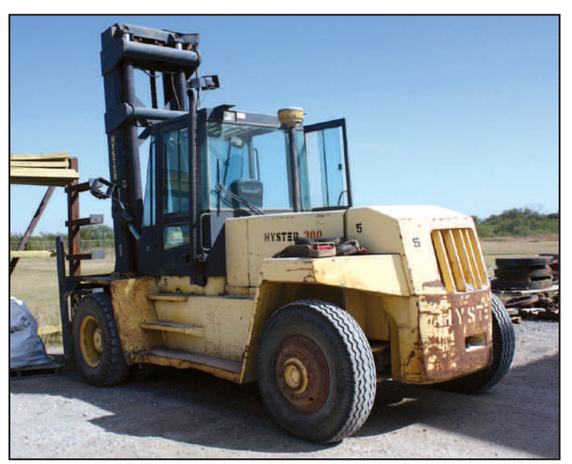
30,000 LB Hyster Mdl. 300XL Diesel Pneumatic Yard Tire