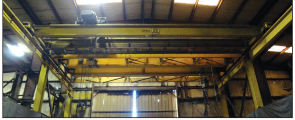
View of 20 & 30-Ton Bridge Cranes