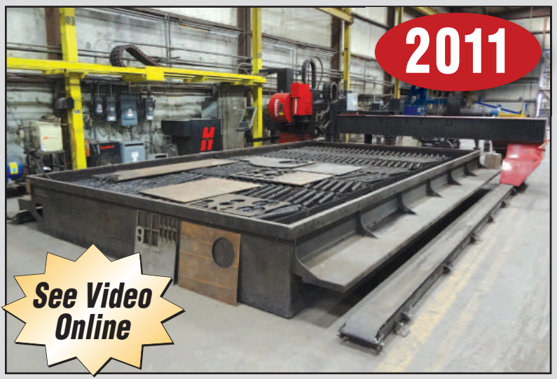
15' x 25' Kinetic Model K3000XMC Combo. CNC Drilling & Plasma/Torch Cutting Machine

Including: Heavy Plate and Pipe Fabricating Machinery, Car Bottom Furnace, Paint Booth, Weld Positioners, Tank Turning Rolls, Welders, HD Lift Trucks and Support Equipment