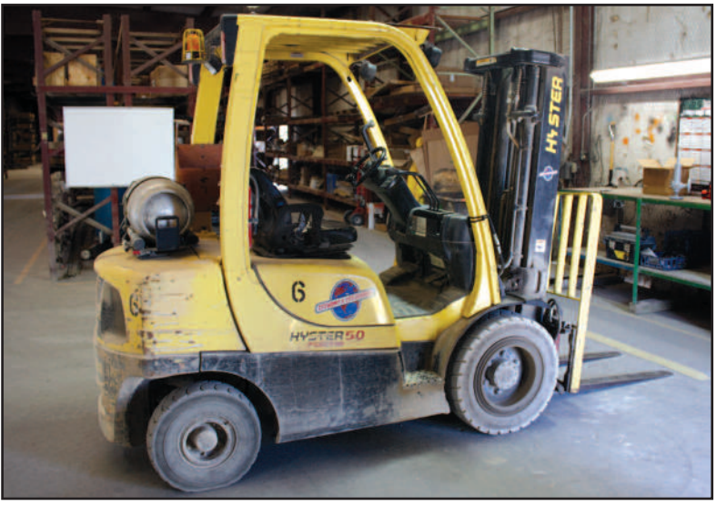
4,000 LB Hyster H40XL LP Gas Pneumatic Yard Tire Lift Truck