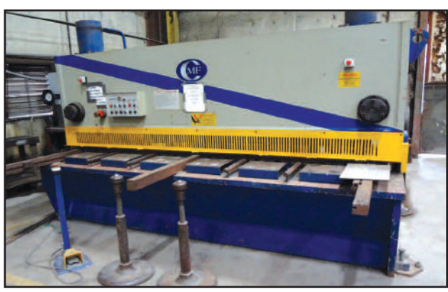
5/8" x 10' CMF Mdl. CS1630 Hydraulic Squaring Shear