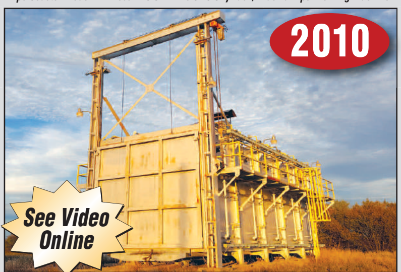
Car Bottom Furnace, 40'x 12'x 12', Range 1150°- 1700°