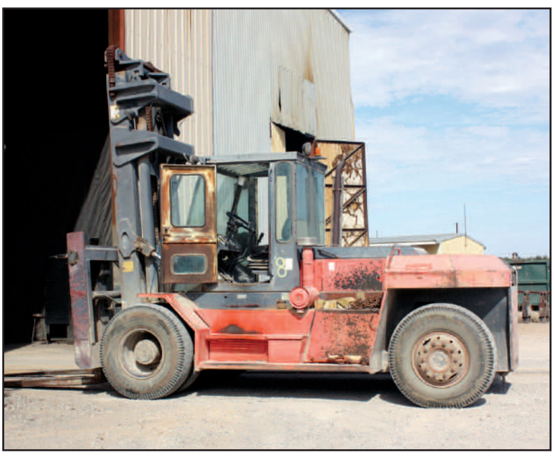
30,000 LB Toyota Mdl. 13000D Diesel Pneumatic Yard Tire Lift Truck