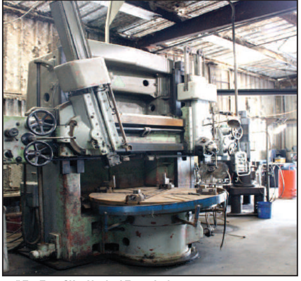
64" Taz Type SK16 Vertical Turret Lathe