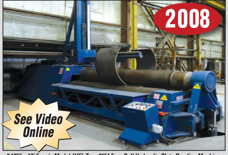
2.125" x 10' Faccin Model 4HEL Type 3154 Four-Roll Hydraulic Plate Bending Machine