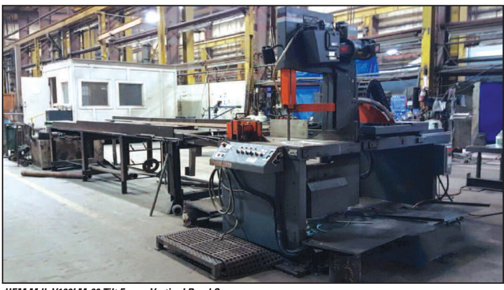
HEM Mdl. V100LM-60 Tilt Frame Vertical Band Saw