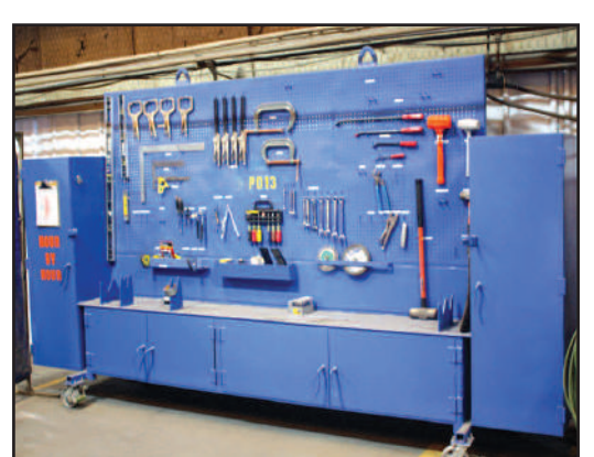
View of Work Bench