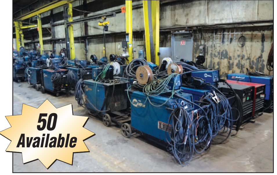
View of Welders