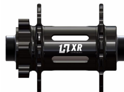
FRONT HUB 15MM