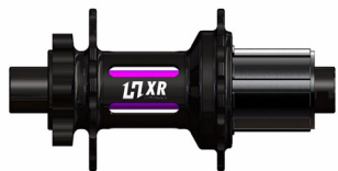
REAR HUB 12MM

Available in 4 colors : RAW/ BLUE/ RED/PURPLE