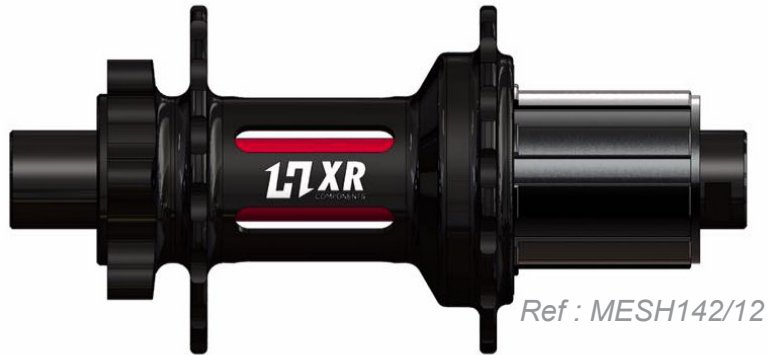
Ref : MESH142/12