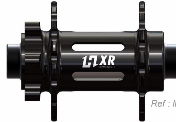
Ref : MESH15