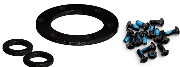
Ref : BS1R