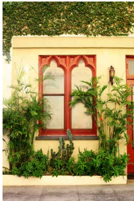
Clockwise from top left: Pasadena's popular Parkway Grill serves up delectable favorites. | Placing the finishing touches on a fragrant and colorful Rose Parade float. | A plate of delectable chilaquiles at the hip La Grande Orange Café. | Exploring Old Pasadena is an excellent way to enjoy the city's history and distinctive architecture. | The exquisite Huntington Library, Art Collection, and Botanical Gardens' award-winning exhibits are a must-visit destination in Pasadena. | Art lovers admiring the Pasadena Museum of California Art's Someday Is Now exhibit. Photo: Corita Kent | The Norton Simon museum's outdoor sculpture garden is an art-filled retreat. Photos: Visit Pasadena