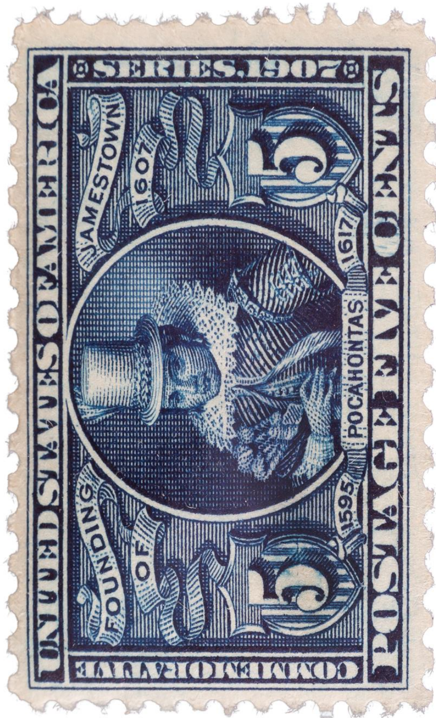
Five-Cent Stamp, The Bureau of Engraving and Printing, Washington, D.C. (1907).