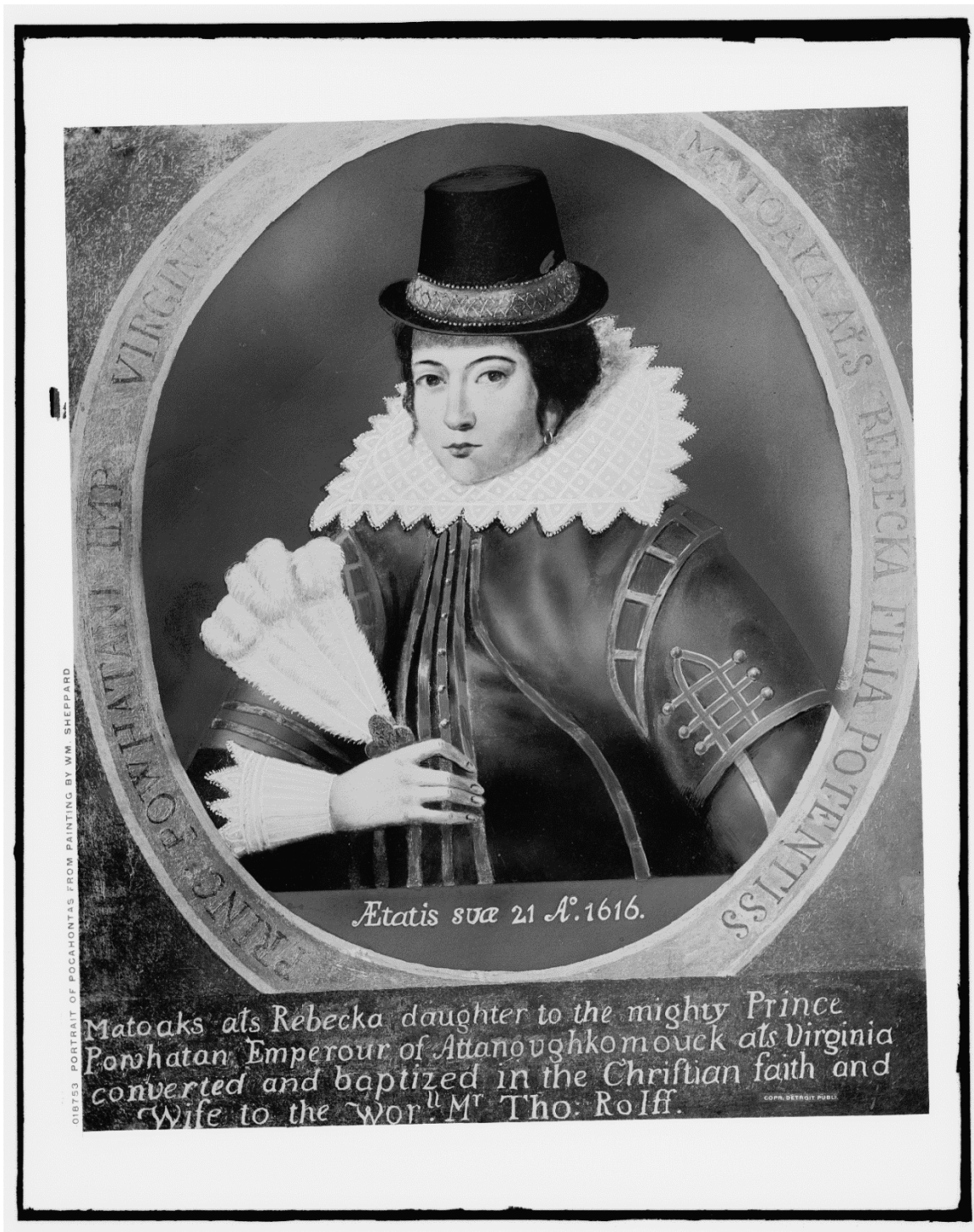
"Portrait of Pocahontas, from painting by Wm. Sheppard" (c. 1900-1920).