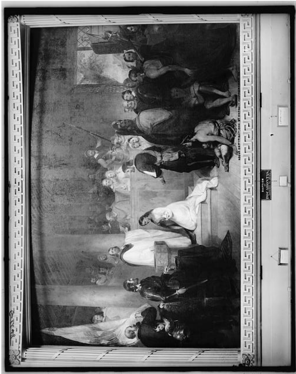
Chapman, J.G., "Baptism of Pocahontas [at Jamestown, Virginia, 1613]" (c. 1904).