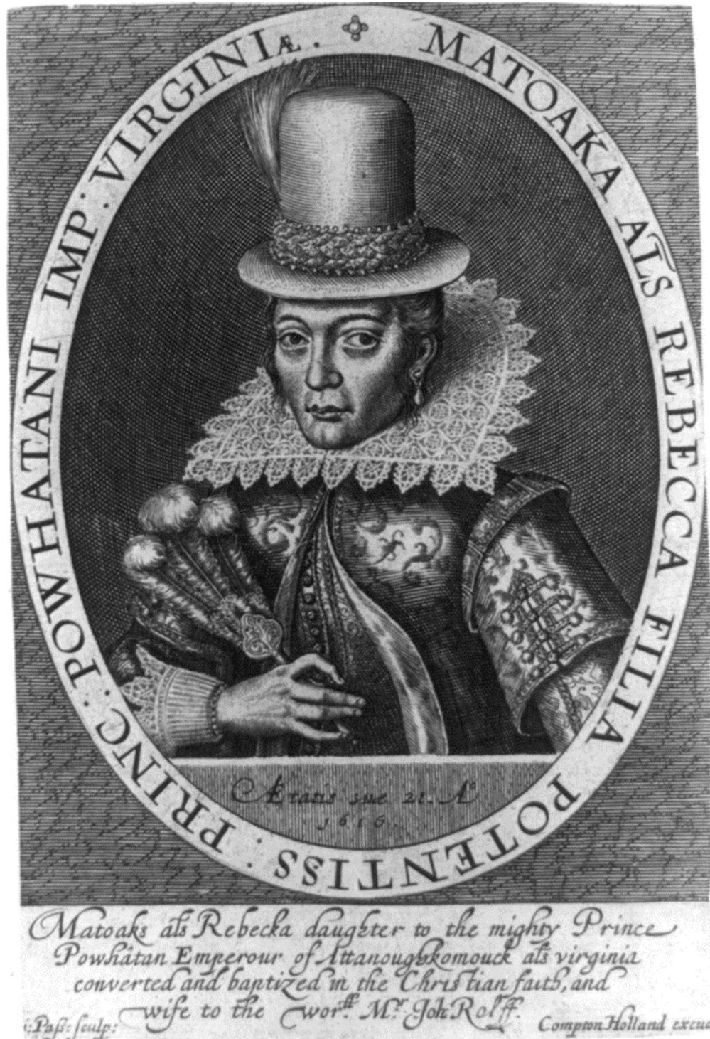
Van de Passe, Simon, "Matoaka als Rebecka daughter to the mighty Prince Powhatan" (1616).