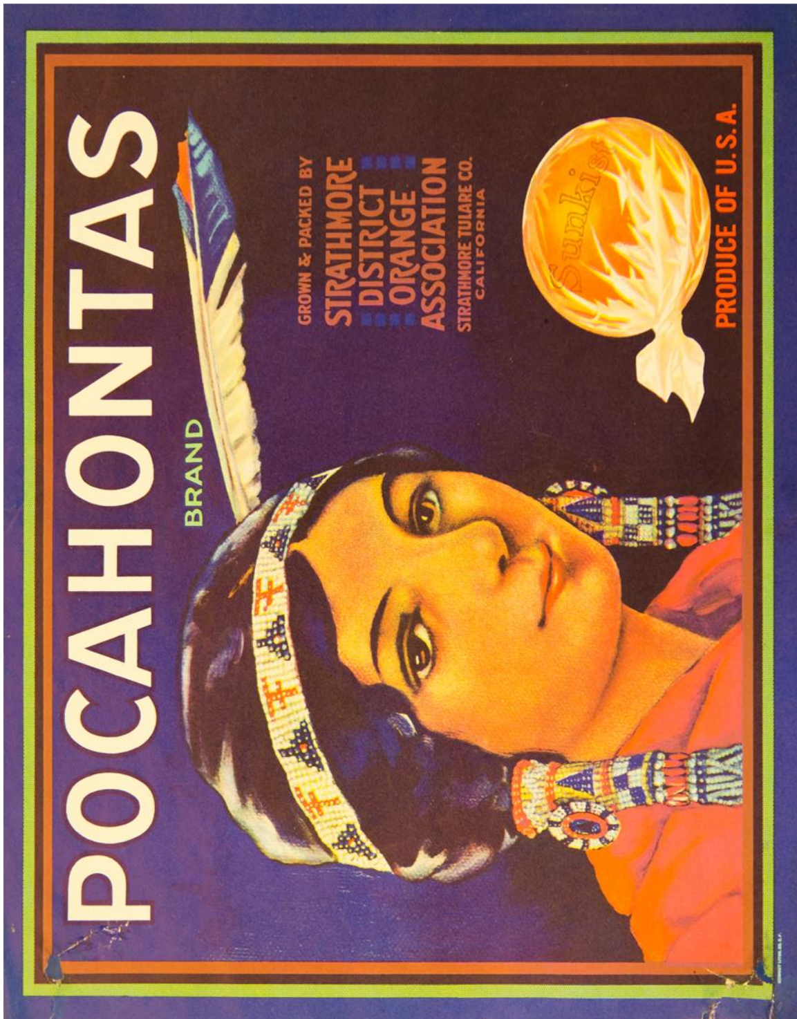
California Fruit Growers Exchange, Los Angeles, CA (c. 1940s).