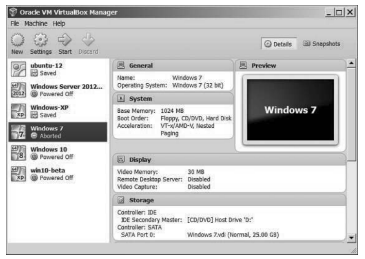
FIGURE 13.2 VirtualBox Manager window

the hardware and therefore run less efficiently. Examples of this include Microsoft Virtual PC and Oracle VirtualBox. Figure 13.2 shows an example of VirtualBox. You will note that it has a variety of virtual machines inside, such as Windows 7, Windows Server, and Linux Ubuntu.