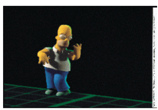
The series at right illustrates Homer Simpson's transformation from a 2D cel-animated character into a 3D CGI model.