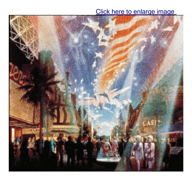
Computer Graphics World December, 1995

Interested in a subscription to Computer Graphics World Magazine? Click here to subscribe!