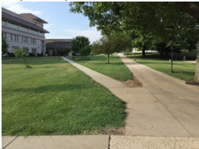
Figure 6: Quad by PG, HS & HT

One College Campus Landscape Master Plan