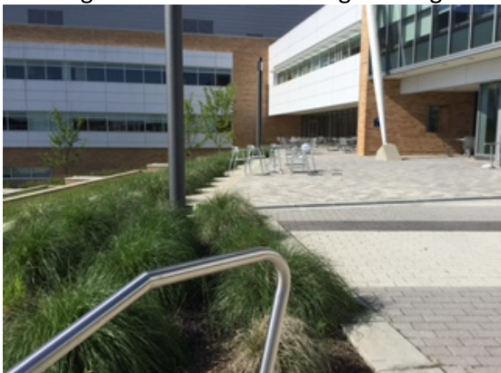
Figure 9:east entry plaza of BE

The Facilities Master Plan 2013-2023 also identifies that the placement of the new Library Learning Commons should include the design of an entry plaza and open space that will tie this site to the existing east lawn quad of BE.