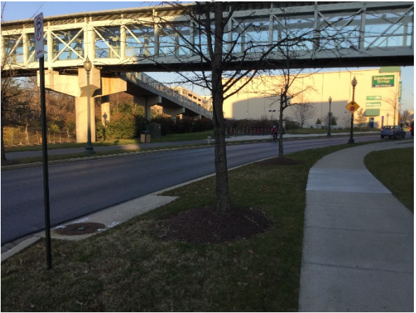
Figure 2: Pedestrian bridge over Fenton St.

facility could act as a well-lit, active beacon that would facilitate a stronger connection and outreach to the Takoma Park and Silver Spring communities." <sup>6</sup>