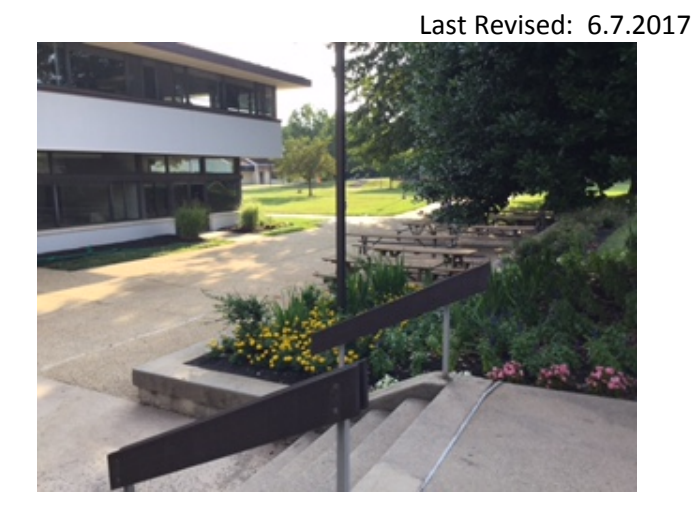
Figure 8: courtyard at lower level HS

One College Campus Landscape Master Plan