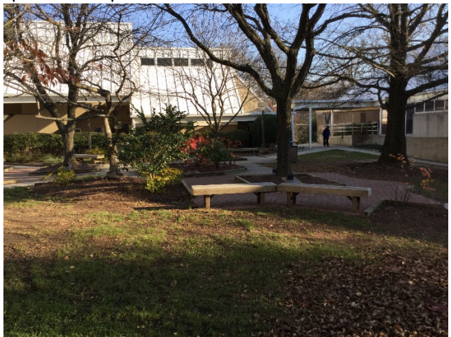
Figure 3: Courtyard between SN, NP & MP with the Miller Memorial Garden

One College Campus Landscape Master Plan