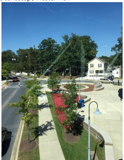
Figure 4: Entry plaza at ST

One College Campus Landscape Master Plan