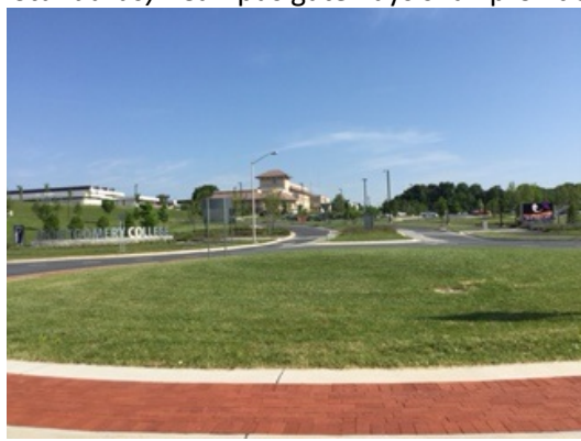
Figure 10: south Landmark Gateway Signage

Standard components for new Landmark Gateway Signage (LGS) have been approved and each new Campus Gateway site project or new gateway building will be designed with these components (see the College Design Standards ). Campus gateways shall provide: