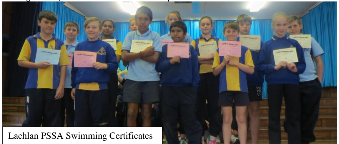
Lachlan PSSA Swimming Certificates

Attached to our newsletter today is information that parents may find helpful in relation to regular school attendance. This document is primarily for the parents of children starting school, however contains some helpful hints for all families.