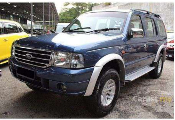
Appendix 1 Appendix 2