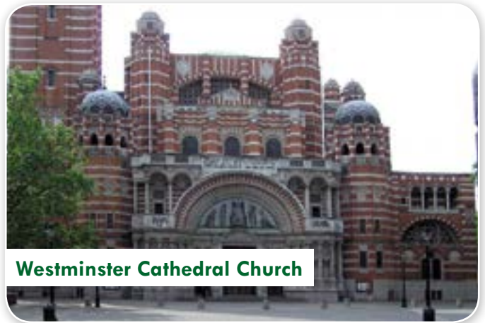
Westminster Cathedral Church