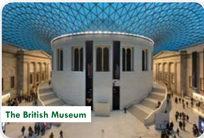
The British Museum