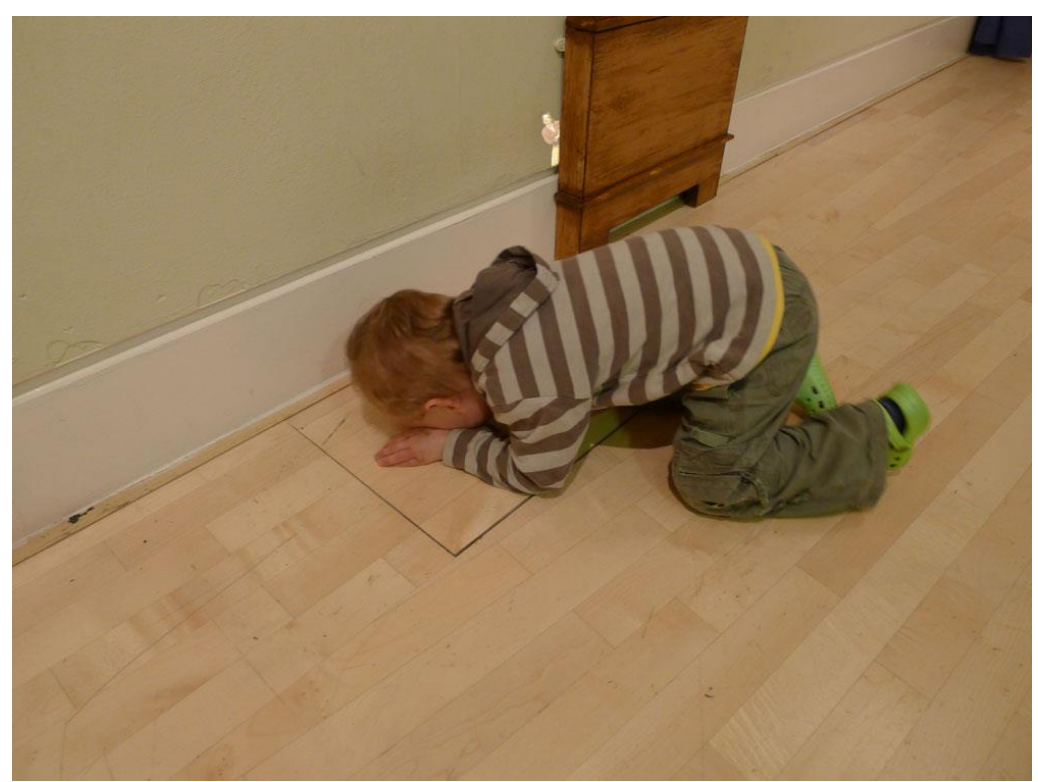
Figure 2: A child peeks under the floor of the exhibition space next to the grandfather clock near where he has observed a Borrower.

The connection between the story and the interactions afforded by the installation was clearly demonstrated when the Borrowers were noticed by visitors, which always led to an elevated level of shared excitement. Adults responded by pointing and encouraging their children to physically look for the Borrowers. Children responded to this by actively looking for them, using their whole bodies to interrogate the space, searching the physical aspects of the room implicated in the augmentation such as the clock and picture frames on the wall, or trying to peer underneath the floor (see Figures 2 and 3). Children's intensive bodily interaction and physical engagement with augmented reality installations in museums is reported in many studies; Snibbe and Raffle (2009) and Price et al. (2016) delved deeper by providing suggestions on the design of specific aspects of the technology, such as the use of shadows and symbols to facilitate the mapping between actions and system responses to encourage physical engagement. Their insights, however, reflect their focus on whole-body interactive immersive systems that are designed to generate audiovisual feedback to explicit user actions rather than subtler forms of slow augmented reality systems such as The Borrowers installation, which did not explicitly aim to encourage intricate physicality.