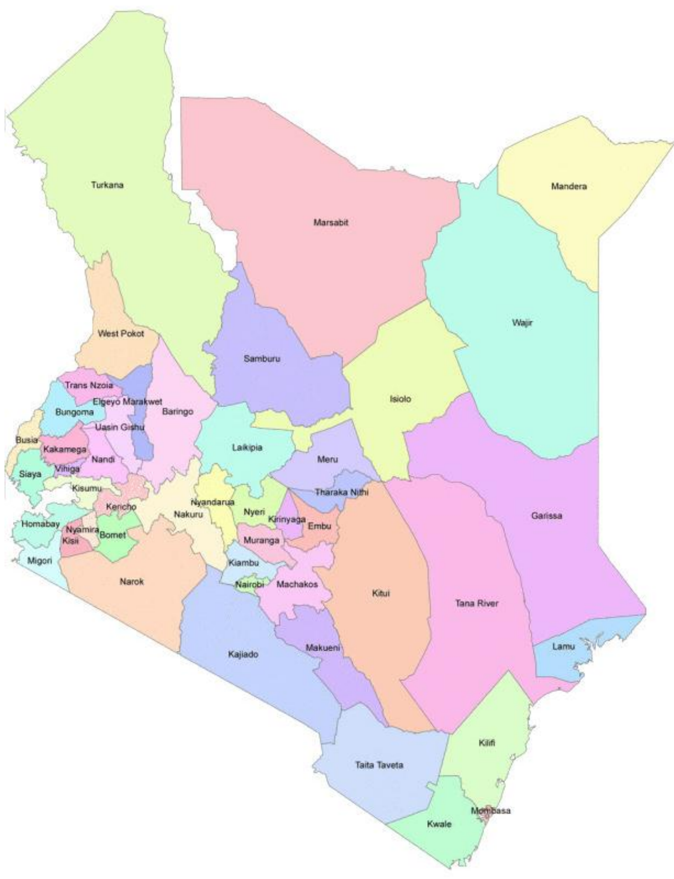
Appendix 1: Map of Kenya's counties