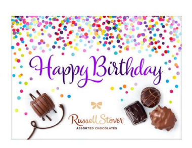
4.6oz Russell Stover