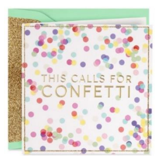
SO HAPPY FOR YOU!

Shipping to recipient (value shipping rate-$5):____ Curbside pickup (free):____