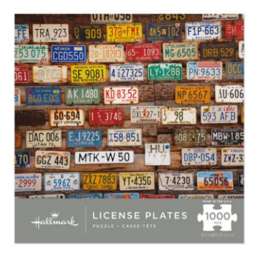
1000 pc License Plate Puzzle

Shipping to recipient (value shipping rate-$5): Curbside pickup (free):