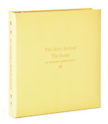
The Story Behind the Bump