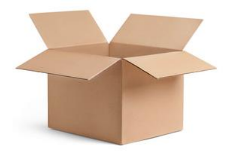
Complete Congrats Bundle (all 6 items shown above)