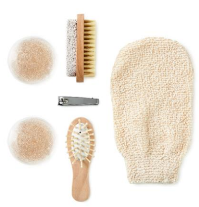
Spa Day Self - Care Kit