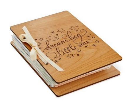
Dream Big Card Keeper