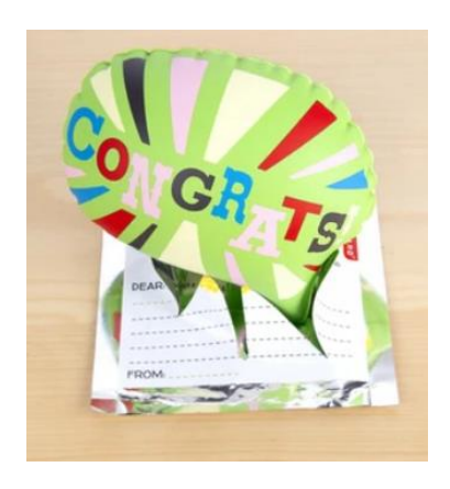
Pop Up Congrats!