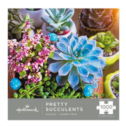
Succulents Puzzle 1000 pcs

Shipping to recipient (value shipping rate-$5):____ Curbside pickup (free):____