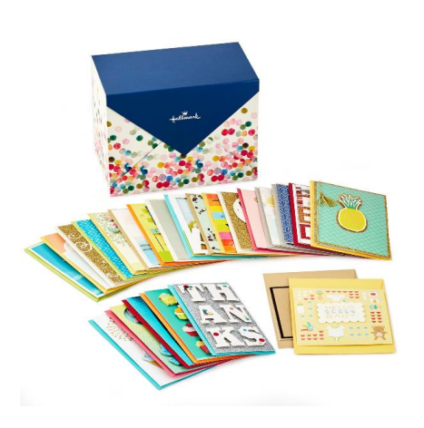
Card Organizer Box with 24 All-Occasion Cards

Shipping to recipient (value shipping rate-$5):____ Curbside pickup (free):____