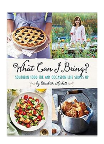
What Can I Bring Cookbook