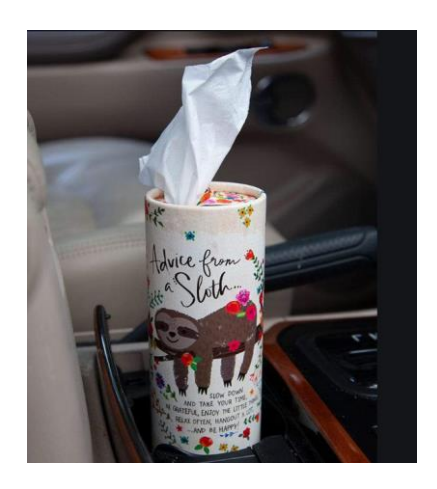
Sloth Car Tissues, Fits in Cup Holder Set of 3 with 60 tissue in each