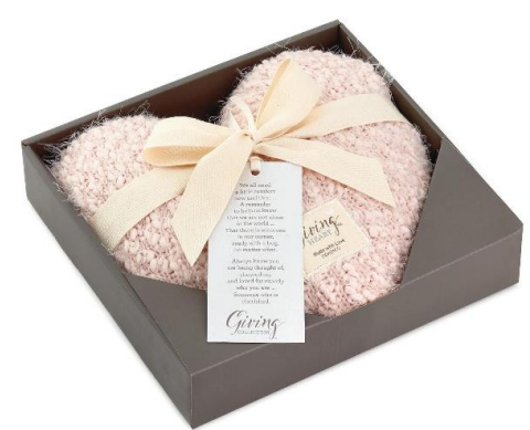
Dusty Pink Giving Pillow Weighted pillow heart shape