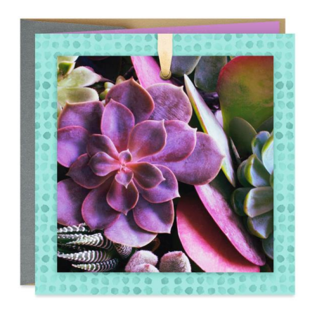
Succulent Blank Card