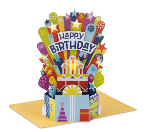
Pop up Happy Birthday Card With Sound and Light