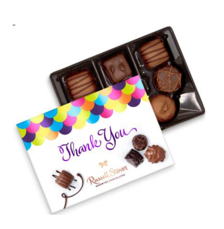
4.6 oz Russell Stover Chocolates