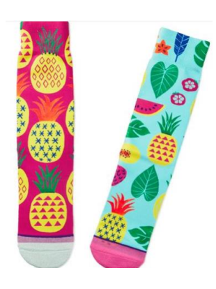
Toe of A Kind-Pineapple