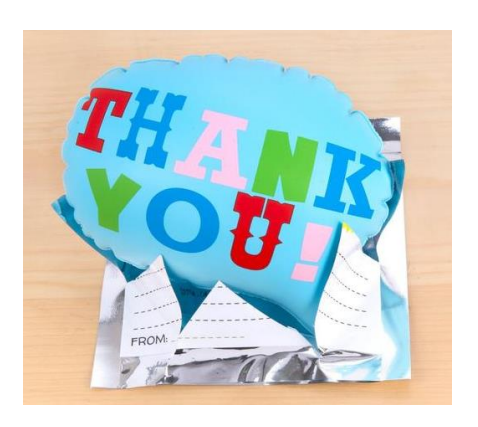
Pop up Thank You Balloon Hit Flat Pack, then shake