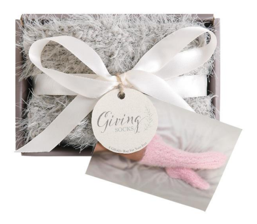
Dusty Pink or Gray Giving Socks Comes in Gift Box