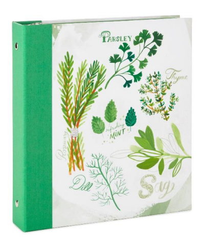
Herb & Spices Recipe Organizer Book