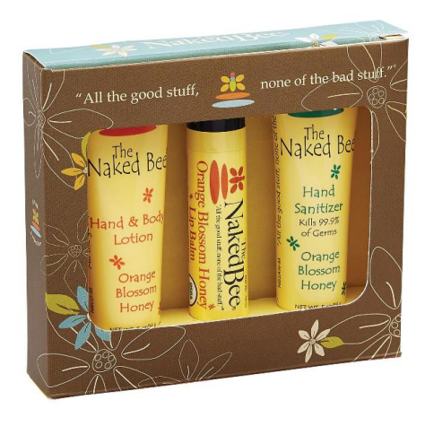
Mini Bee Kit with Hand Sanitizer, Lip Balm, and Hand & Body Lotion