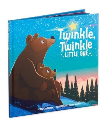
Twinkle Twinkle Book