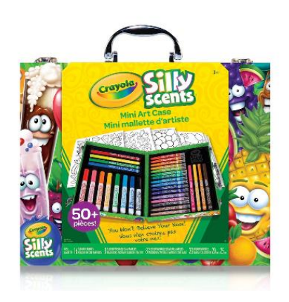
Silly Scents Washable Slim Markers Ages 3+