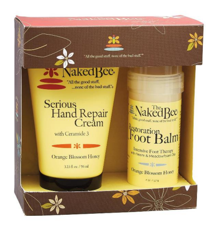
Hand Cream & Foot Balm Kit Orange Blossom

Shipping to recipient (value shipping rate-$5): ____ Curbside pickup (free):____