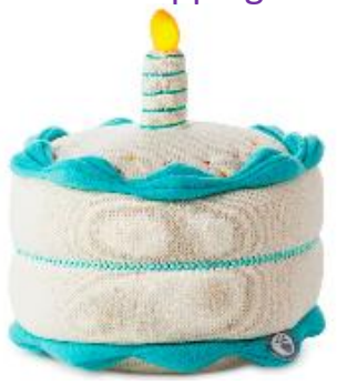
Interactive Birthday Cake

Shipping to recipient (value shipping rate-$5):_____ Curbside pickup (free):_