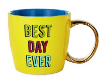
Best Day Ever 14.5oz Mug