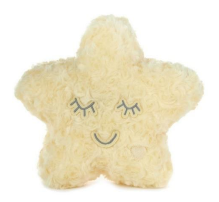
Star Recordable Plush