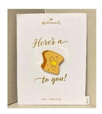
"Here's a Toast to you" Pin