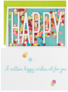
Happy Birthday Card