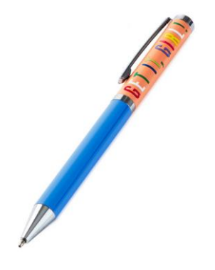
"Get it Girl" Pen