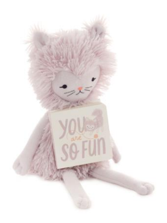
MopTops Furry Cat with You Are So Fun Board Book