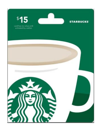
Starbucks Gift Card