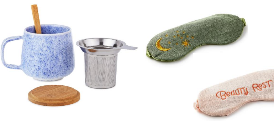
Tea Infuser Mug Set, 4 Pieces