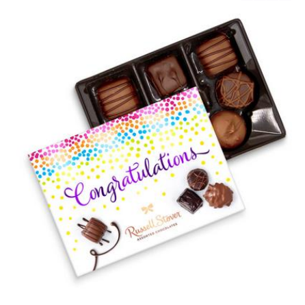
4.6oz Russell Stover Chocolates