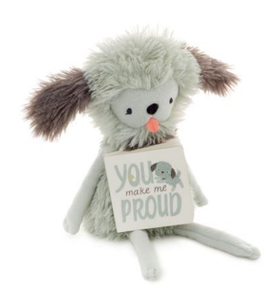
MopTops Shaggy Dog with Make Me Proud Board Book