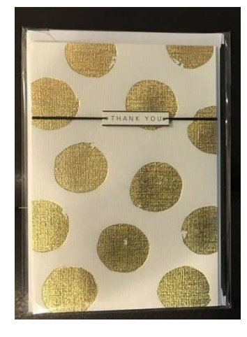
Gold Foil Polka Dot (Blank inside)